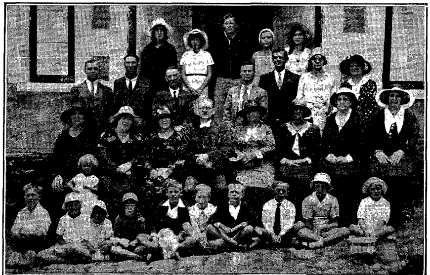
INTERESTED PERSONS AT FRANKFORT.

FOR the encouragement of our members throughout the conference, I thought it would be of interest to give a brief summary of the effort and work at Frankfort. Prior to our arrival there was a gentleman conducting special meetings here. These meetings aroused opposition and later when our meetings were advertised prejudice ran high. Efforts were made to warn the people. After it was learned which denomination we represented books and pamphlets written against us were distributed. The warning had some effect on the people, for our meetings were not so well attended as we expected, yet we claimed God's promise,— "If God be for us who can be against us." With this thought and prayer we went forward in the power of Him who has never failed us. Our