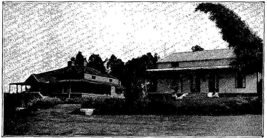
NEW HEADQUARTERS, BLANTYRE, NYASALAND.