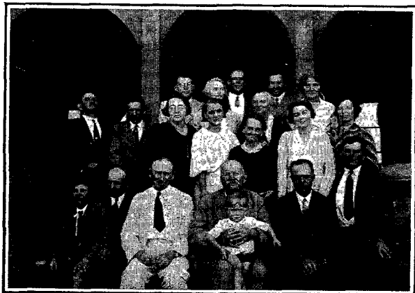
European Church Members, Kenya Colony.