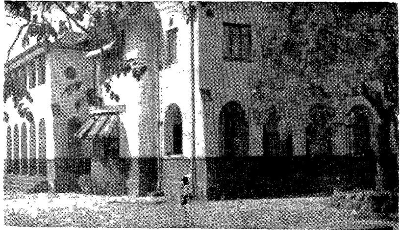
Above.— Rhobecon Preparatory School.

The school has had many advantages to enjoy but there have also been some setbacks and problems to battle against. With courage and determination, and with faith in God the staff press forward to build up an educational centre that will be a haven of refuge for Seventh-day Adventist youth of the Rhodesias and Nyasaland, and a credit to the denomination.