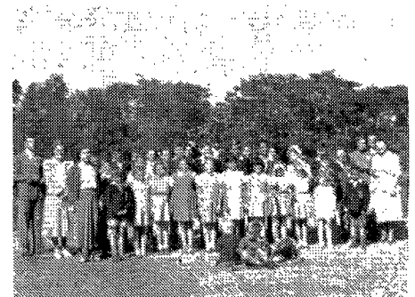
Right.— The staff and pupils of Rhobecon School.