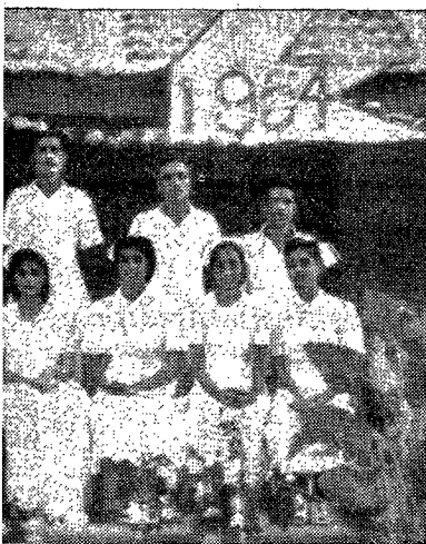
for 1954 and their sponsor, burner.