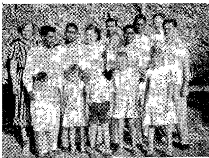
The Seventh-day Adventists at the Vellore Medical College and Hospital.

You will certainly admit that this is a happy group, full of vigour, enthusiasm and pep. Amongst these, the members in the first row qualify themselves most as such. Well, I shall not keep you guessing for long. First