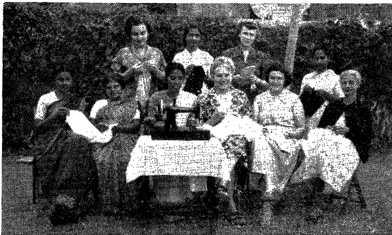
Members of the Bombay Dorcas society.