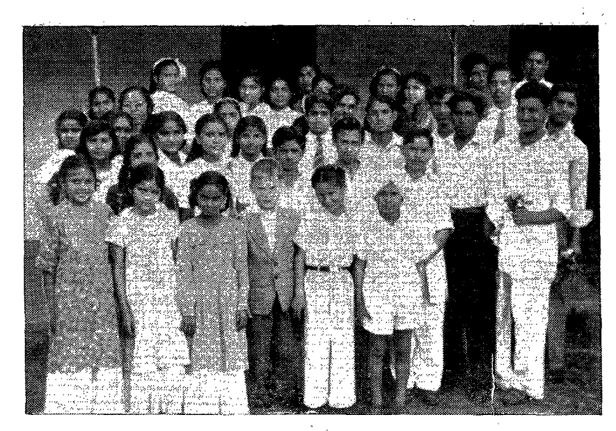
The forty students who were invested on March 15, 1957, at Roorkee School. They represented all the eight MV Classes.

"Whatsoever He saith unto you, do it." (John 2:5), I am become as a rusted saw of the Great Carpenter.