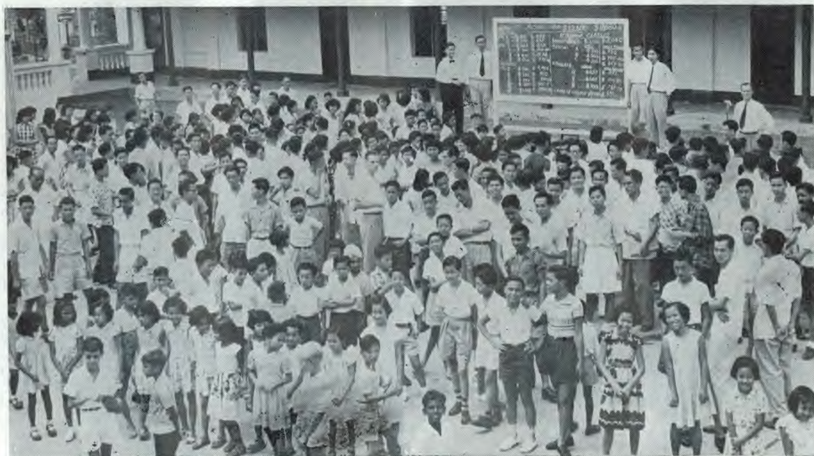
A portion of the Malayan Union Seminary faculty and students at the close of the 1955 Harvest Ingathering campaign.