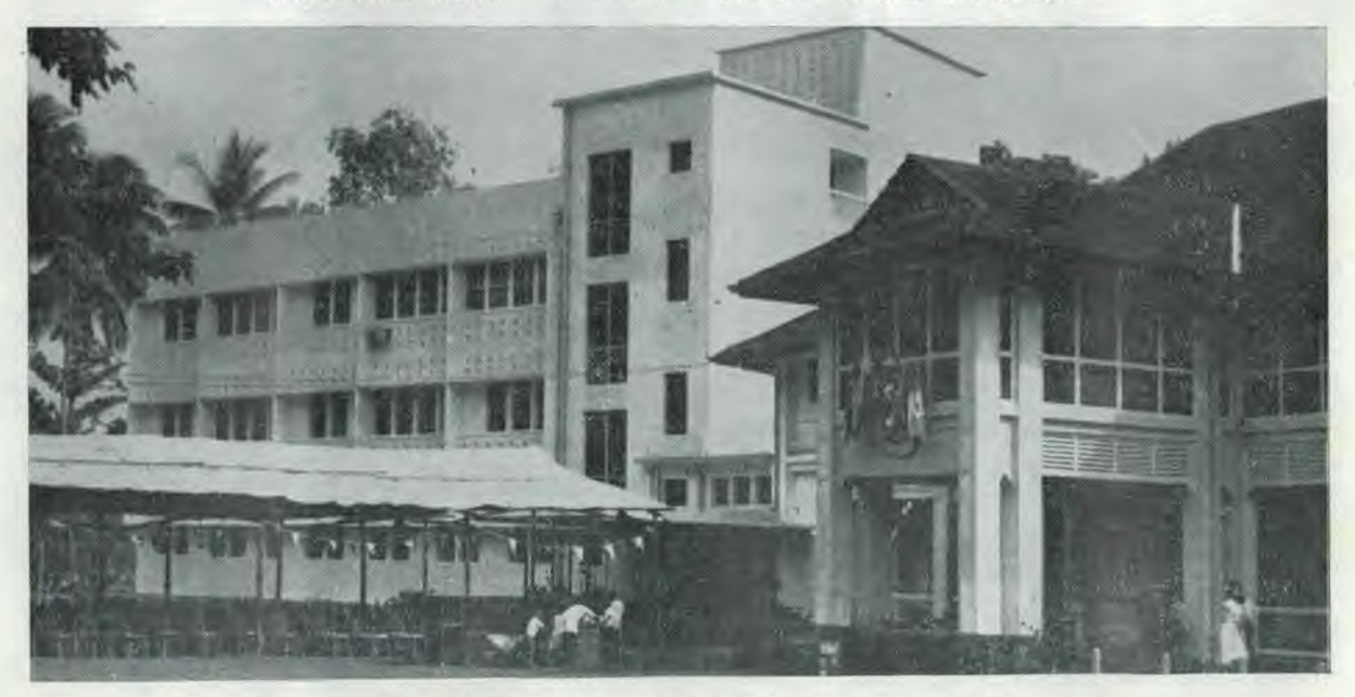
Day of the opening and dedication, January 30, 1958.