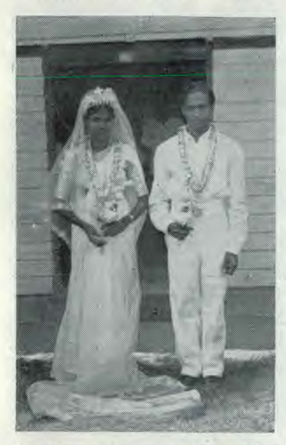
Church members recently married in the Bagon Datoh church. We wish them heaven's richest blessings as they establish their new home.