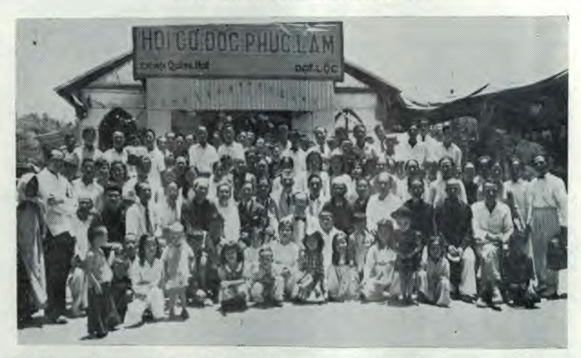
The new Quang Hue church, Vietnam, erected by the members who are standing and sitting in front of the building at the time of its dedication.