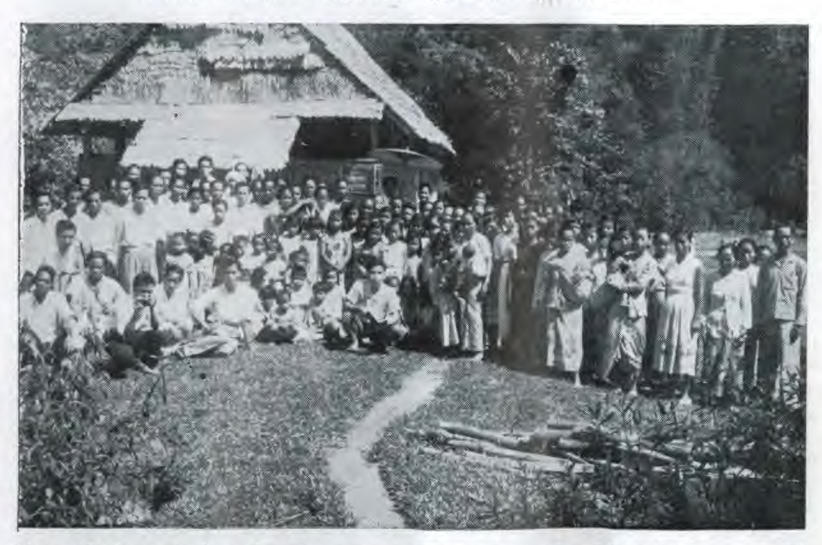
One of the interior church groups with whom the Training class held an effort standing outside their church building.