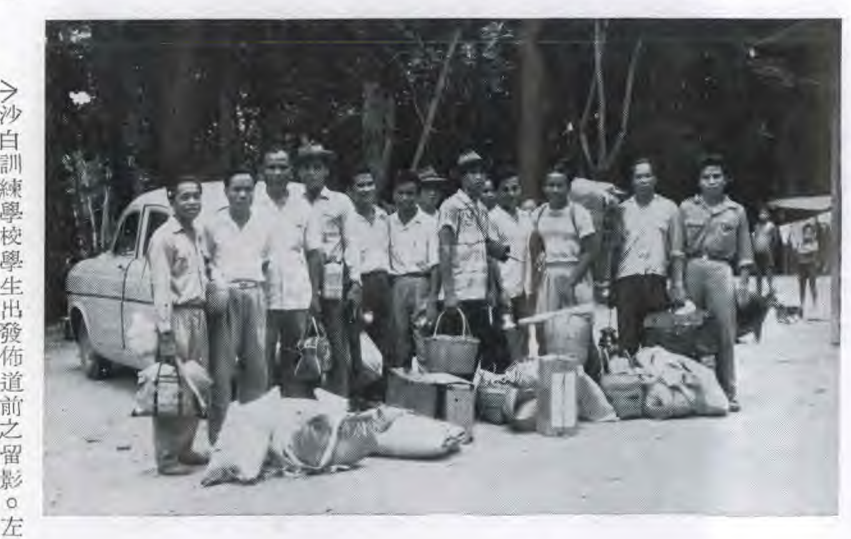
起第三人是導 →沙白訓 練學校學生出發佈道前之留影 師包漢牧師 0

學行二星期的聚會。在此 , 旧 依然得照常進行學校中的活動 們的計畫是在我們所 期間 探訪的每個教 我們雖然離開學 , 因此 會中各 , 我