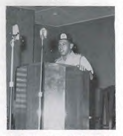
Lieutenant Aeria of the Traffic Dept., Singapore Police, addressing students in chapel.

ground were attached to car bumpers, telling the people of Singapore that "Safety Demands Sober Drivers."