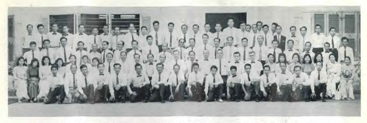
Pictured Above Are the Colporteurs Mission Workers who attended the Institute in Vietnam