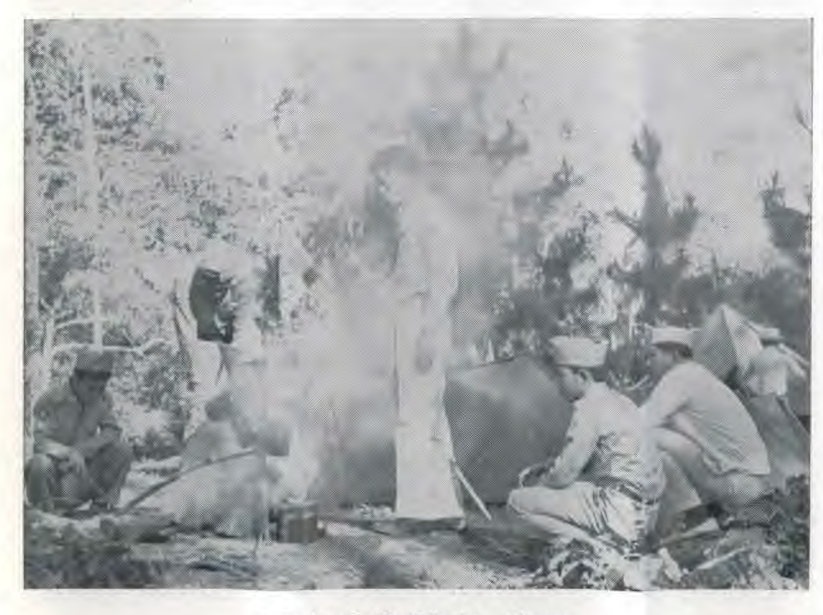
Thailand Pathfinder Camp