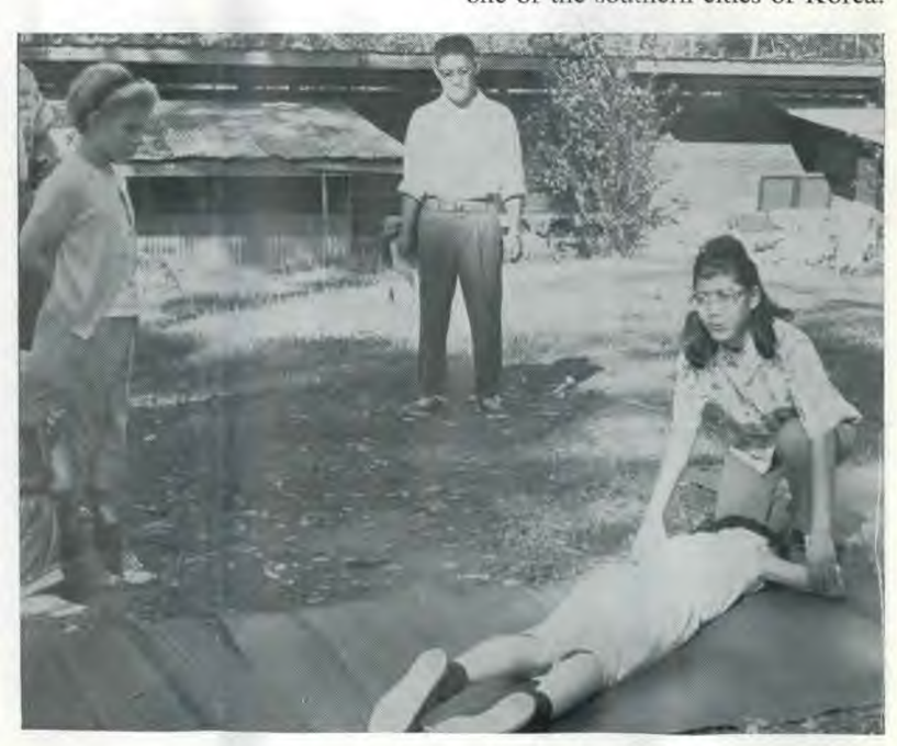
Thailand Pathfinders Learn First Aid

The Spirit of God has begun to work among the Chinese of Korea. Their need now is a church building, for already about 100 of them are meeting in Seoul, and another group of 20 or so is meeting in one of the southern cities of Korea.