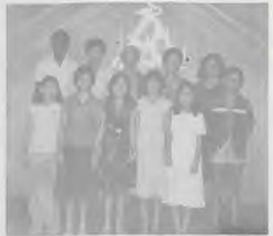
Even of those who responded to God's call.