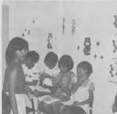
Separate programme for children: Never too young to know Jesus.