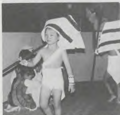
That Pharaoh is sure a hard taskmaster!