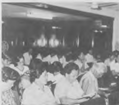
Crusade interests: Never too old to learn of Jesus!