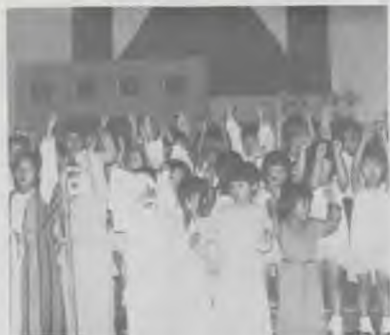
Ipoh Adventist Kindergarten's multi-racial students

Established in 1974, Adventist Kindergarten in Ipoh, Perak continues to grow from an initial enrollment of 18 students to the present 120 students.