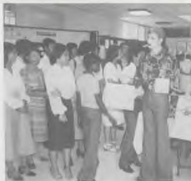
Smoking Sam drawing attention of the public in Ipoh.