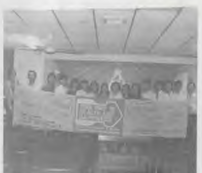
Crusade helpers: We love sharing health and happiness!