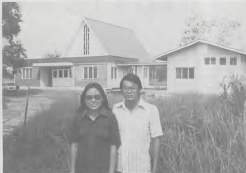
The pastor and his wife standing in front of the Miri Church [with a pastor's parsonage attached] which was dedicated on March 7, 1981.