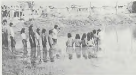
Baptism of 32 Feb. 21, 1981