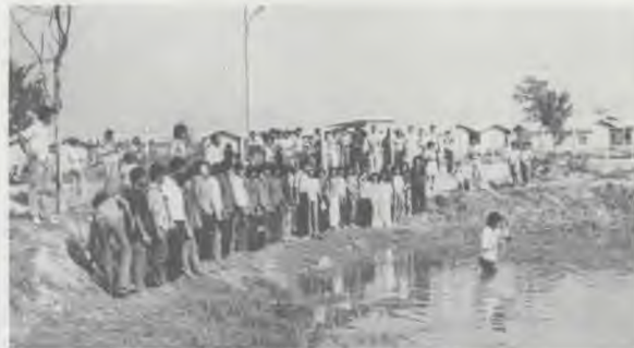
Baptism of 32 Feb. 21, 1981

the "Way of Life" lessons, and he began a "Way of Life" class for all his subordinate leaders. That class has now grown to 60 students.