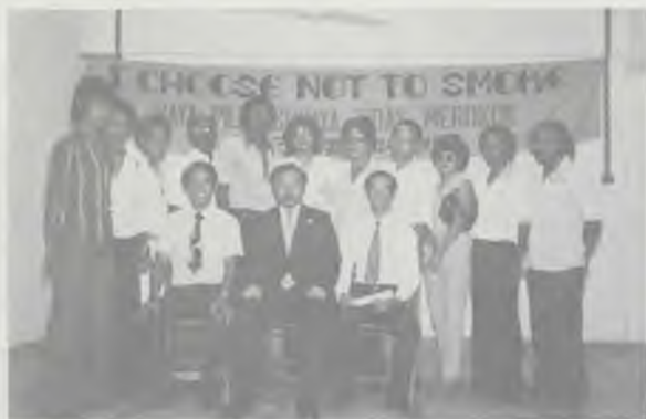
A group of smiling Ex-smokers in Kuantan with the Five Day Plan Team.