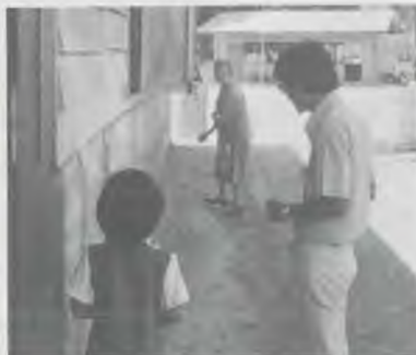
An eye check for one student at Gaur Mission School