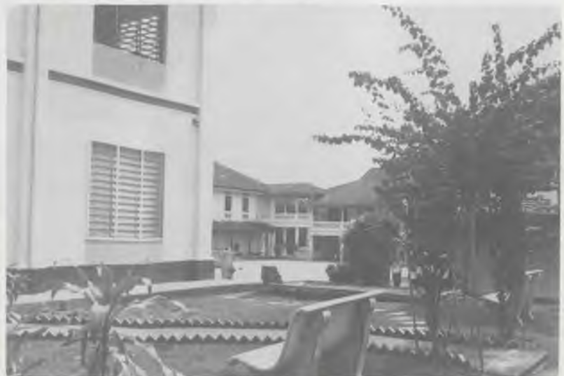
A section of the SAUC campus

for applications and further information.