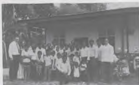
A group picture after the Banting Tamil Church Service.