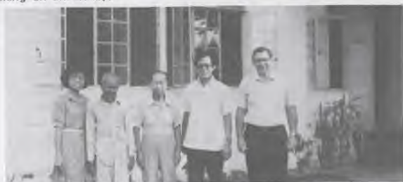
With the inmates at the Ipoh Old Folks Home.