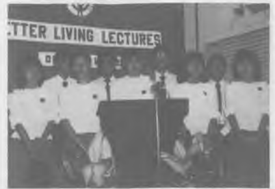
The Melaka Youth singing a special song during the Better Living Crusade.