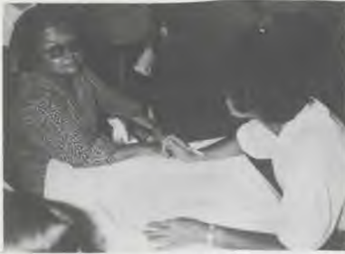
People queuing up for Blood Pressure Test and Counselling.

For instance, rent of the floor space at People's Park for a commercial exhibition of the same duration would cost S$19,000, but was provided free.