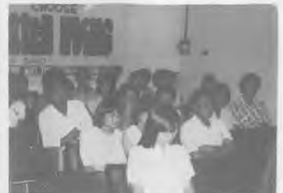
Part of the audience during the crusade.