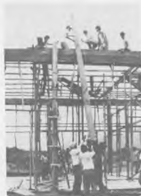
Hoisting up rafter pieces on the new Pasir church.

The new and old Pasir Church seen standing side by side. Note how the members are "cannibalizing" the old church by taking off siding boards to build forms for the cement on the new building! As soon as the new building becomes functional, the old one will be removed to make way for the front porch and entrance.