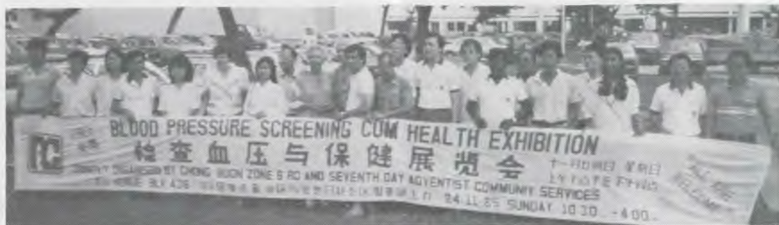
Participants who helped at the recent blood pressure and health exhibition.