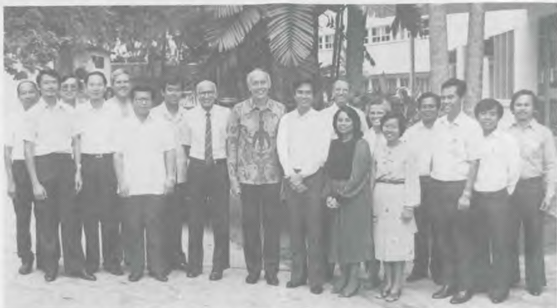
Southeast Asia Union participants at the recent Church Ministries Department workshop held at the Far Eastern Division headquarters.