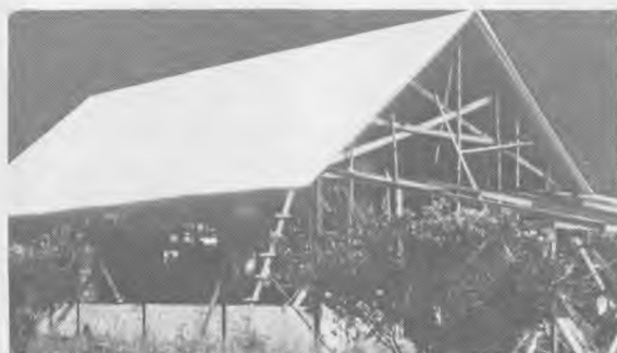
The new Engkaruh Church in progress.