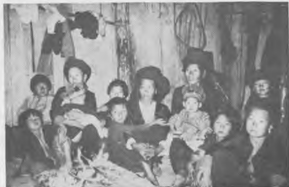
Tungsai church members listen attentively during seminar.