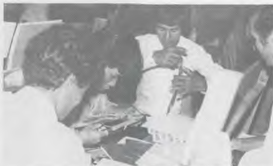
Men busily making visual aids during the workshop.