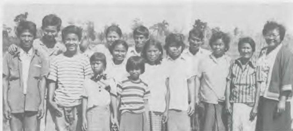
Eleven young believers standing with friends at their recent baptism at Siritorn Dam, Ubol.