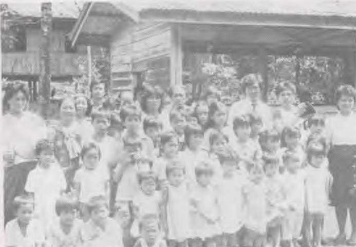
Church members of the Kampung Tahuri Church.