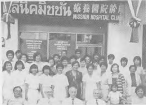
Haad Yai Mission Hospital staff.