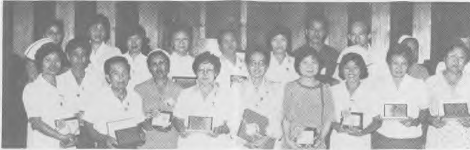
Twenty-eight employees received awards for having served BAH for many years.