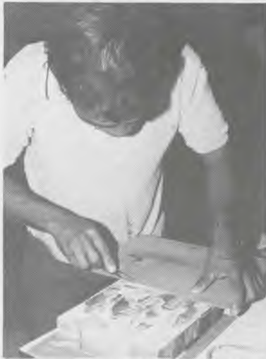
Village Lay Pastor making a block puzzle as a special Sabbath toy for his children.