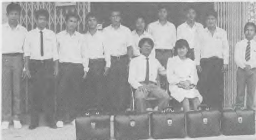
Twelve-member team of young Literature Evangelists.