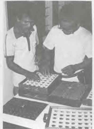
Village Lay Pastors fitting cups into the communion trays they have made.