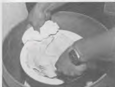
The baked communion bread is coming from the make-shift dutch oven.