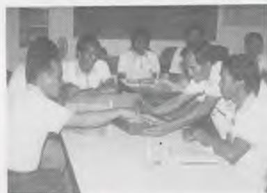
Village Lay Pastors participating in "hands on training" of how to conduct a Communion Service.