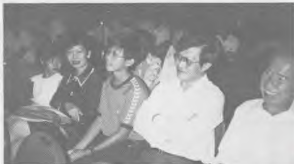
All smiles over Dad's success during the family night of Breathe-Free Plan.