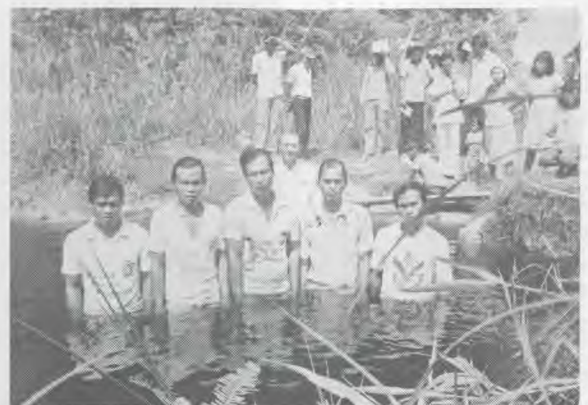
Five Village Lay Preachers baptized at the conclusion of an intensive three-weeks training in Central Sarawak. The three on the left are direct results of the Mission's Health Project in the area.