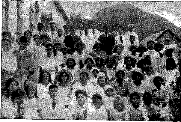
Believers and friends, Seychelles Islands

Early Sabbath morning, the baptismal candidates, the church members, many friends as well as a large host of curious onlookers, gathered at a place called Union Vale. After a stirring sermon by Elder Girou, 27 souls were hurried with their Lord in baptism to be raised again and to walk in the newness of life. After the baptismal service we proceeded to the church where we partook of the emblems of the bruised body and the spilt blood of our Lord.