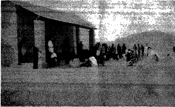
First dispensary, Koza