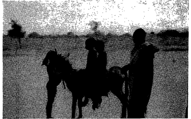
An "ambulance" transporting patients to Koza hospital.

Three native round huts — such as are used by these tribes — were also waiting for in-patients. For several months they were empty, because it had never occurred to these people that someone might come to a hospital (a rather big name for the limited facilities). But a few months later three more huts were needed, and finally there were nine huts, which at times house twenty patients with their family members and attendants.