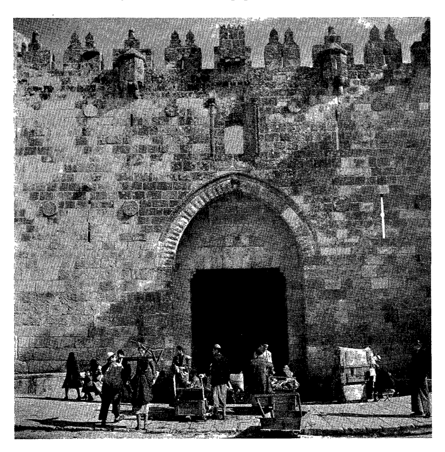
The Damascus Gate, Jerusalem, See article page 8

I want to say with all my heart that we need your prayers, and I would like you to pray especially for Greece this year. We need the Spirit of God to attend our labors, so that the day will come in which we will not only baptize three, but 300 persons. So, don't forget us, we need your prayers, and we are trusting that you will pray for us.