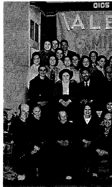
The 46 "Miracles" in Madrid

shine, and below we could see in the shadows of the night a few lights coming from isolated farms. It was easy for us to lift up our thoughts in prayer and homage to the One who has said: "Behold, I am with thee, and will keep thee in all places whither thou goest..." (Gen. 28:15). Thus sailing in the air as a particle of dust what a consolation to us was the text found in Deut. 33:26,27: "Who rideth upon the heaven in thy help, and in his excellency on the sky. The eternal God is thy refuge, and underneath are the everlasting arms."