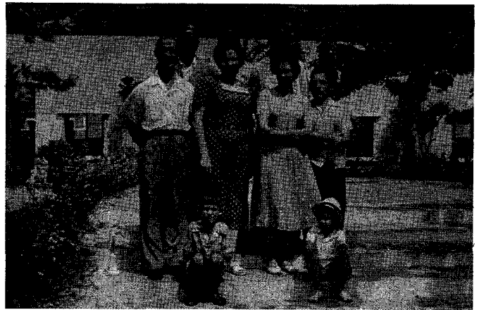
Workers at São Tomé Island