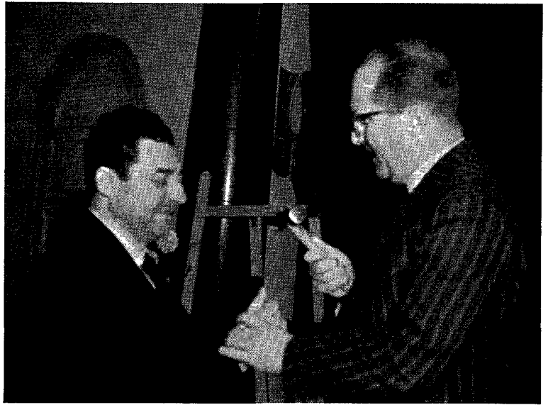
The presentation of the hammer to the newly baptized brother

When the couple sat in the meeting hall in front of the congregation, waiting to be taken into the church, the minister told their wonderful experience to those present. Then he opened a package to give them a gift from the church. It was not a Bible, not a set of the Testimonies , but a brand-new hammer. The minister gave this present to the shoemaker and his wife with these words: "My brother, this hammer has never worked on a Sabbath, and I know that in your hands it will never work on a Sabbath." Then he welcomed the man into the church with a brotherly embrace. Most of the members of the church had tears in their eyes, but they were tears of joy and gladness in Jesus Christ.