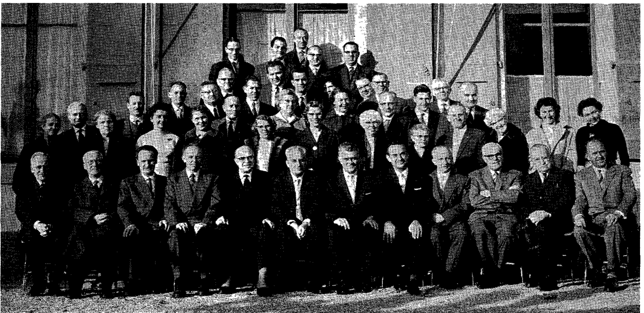
Delegates to the Division Annual Meeting, Gland, 1959

Looking at the force of workers employed within the Division we find that there are 1,933 on the payroll, and adding to them the 196 book evangelists, there are altogether 2,129 men and women engaged in spreading the good news of Christ's Second Coming.