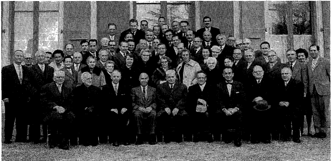
Delegates to the Division Council 1960

The Division membership at the end of the third quarter 1960 stood at 107 716, and the baptisms of the fourth quarter will be more than enough to pass the goal of 8800 for 1960. The Southern European Council closed on the strong central theme of «Christ to the World» by means of a well-planned program of evangelism and a renewal of dedication to this great task on the part of all the delegates.