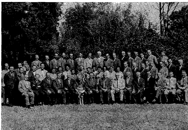
Delegates to the Publishing Convention, Florence

This Convention was a great blessing to all the delegates. We thank God for His presence with us, and we all dedicated ourselves to do more earnest work in bringing the truthfilled literature to as many people as possible, that the end may soon come.