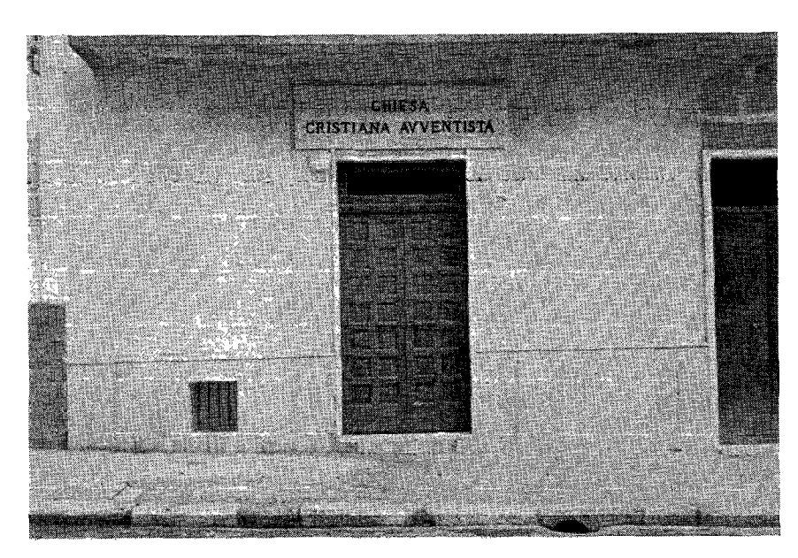
The new church in Gravina

"Protestants have tampered with and patronized popery; they have made compromises and concessions which papists themselves are surprised to see, and fail to understand. Men are closing their eyes to the real