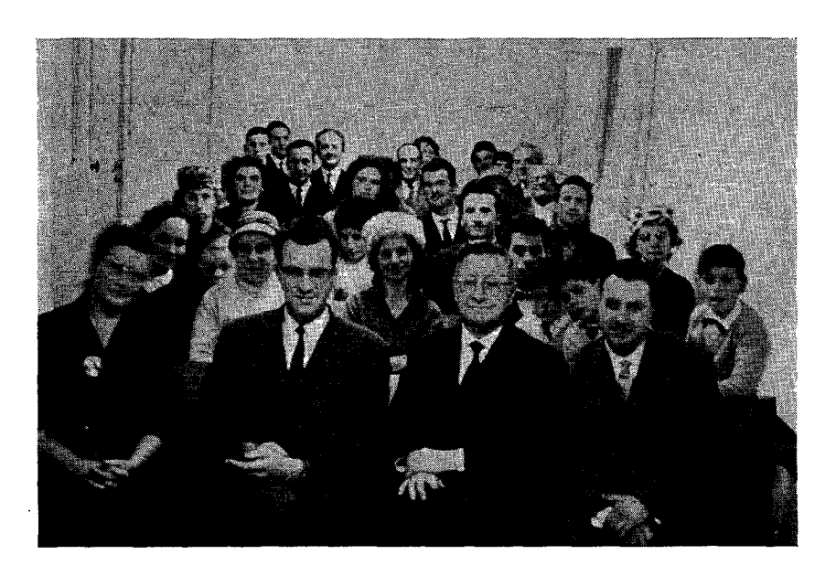
The Italian group in Biel

oughly at home with their Frenchand German-speaking friends in the Biel church.