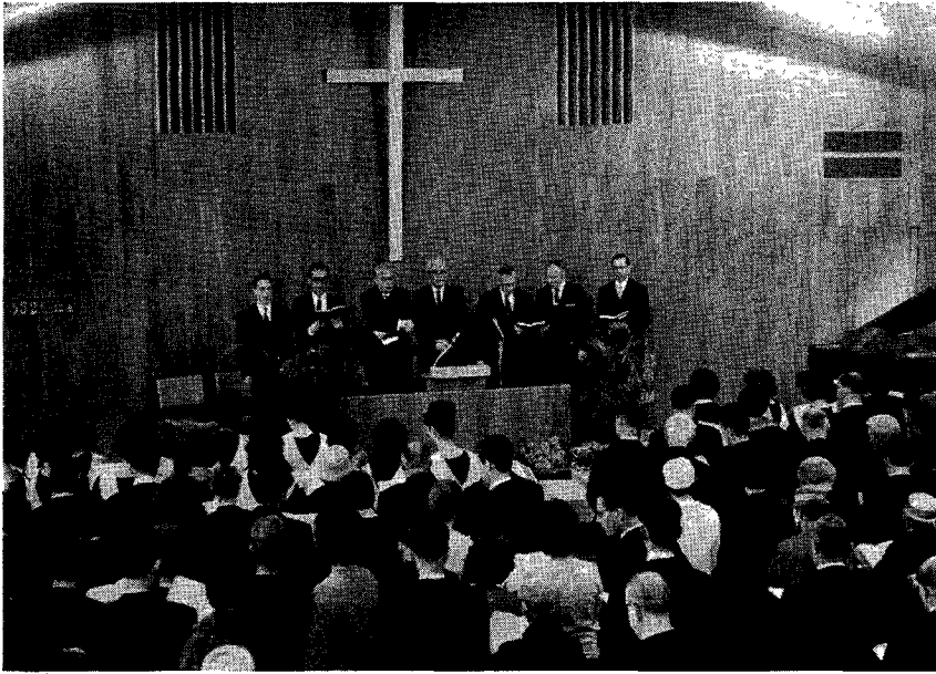
Officiating ministers and a section of the congregation at the Sabbath morning service, December 7.

gation, and surely we may hope that its principles will be increasingly practised by us all.