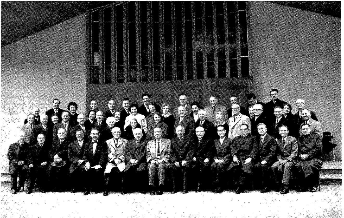
Our happy family – the group of smiling delegates assembled at the front entrance to the church.