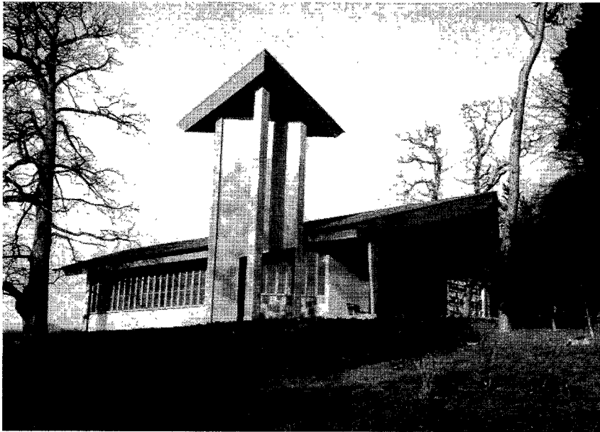
The beautiful new church at La Lignière, where the Council meetings and committees were held.

cumstances determine the success of a council, then the conditions under which ours was held weighed heavily in its favour.