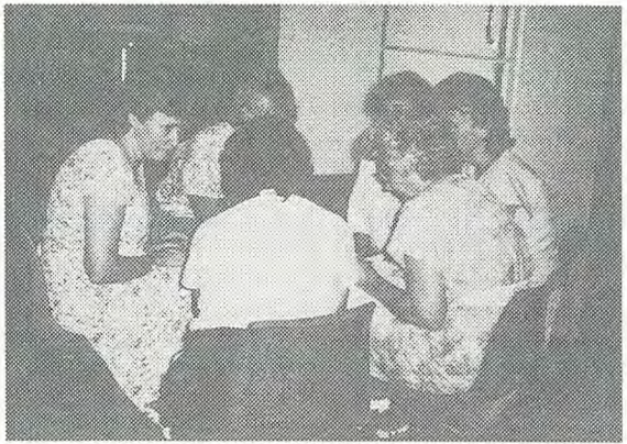
Discussion groups meet at Yarrahappane.

Over 50 pastoral wives, from the Trans-Tasman Union, came together for fellowship at the Yarrahappanne church camp on the beautiful shores of the Pacific Ocean in Australia. A report on what Shepherdess International is doing worldwide was presented. The women appreciated time for fellowship and discussion on the benefits and