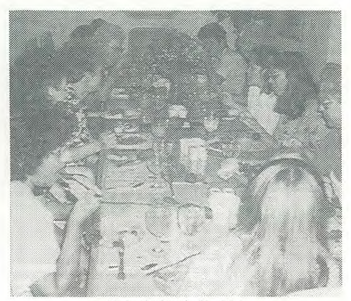
Pastoral wives in Houston enjoy their own prayer breakfast.