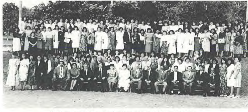
Colombian Union pastoral wives and Union leaders

This exciting magazine is full of varietv—entertainment, craft ideas, puzzles, and pictures to color. There are riddles and a special "Nature Nook." PKs are challenged to stretch their minds in "Quiz