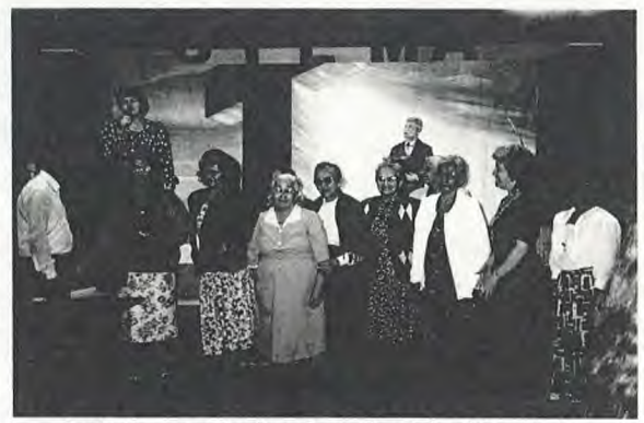
Retired pastoral wives from the Colombian Union receive special recognition

✿ The Southern Union Conference, in Tashkent, hosted a meeting for pastoral wives, and 12 attended. The women from Tadzhikistan and Turkmenistan could not come because of political events and the fact that there was no transportation connection. Please remember these pastoral wives in your prayers. Those who attended exchanged souvenirs