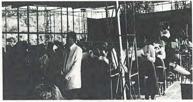
Pastoral wives enjoying Sabbath Services