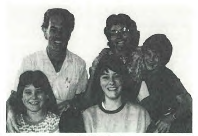
The Stafford Family