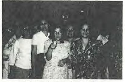
Pastoral wives from Cuba