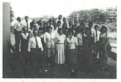
Pastoral couples in Brasilia after a delightful luncheon.