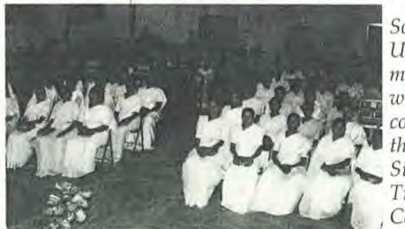
South India Union ministerial wives who completed the Bible Study Training Course.