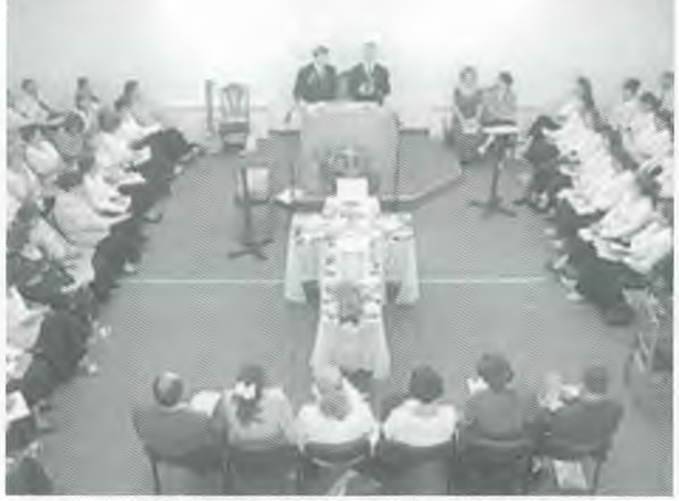
Participants of Moldova Union Congress around the table for communion.