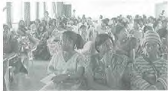
Shepherdess meeting in Ghana