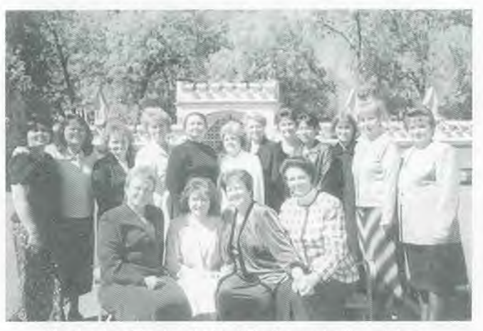
Shepherdess Meetings in Ural Conference in Ekaterinburg.

from Ukraine, Caucasus and Belorussia Conference were special guests and shared seminars with the participants. Spiritual revival was given special emphasis when everyone participated in a Lord's Supper dedication service. See photo below of participants at commuion table.