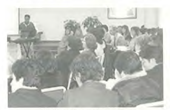
AFAM coordinators in a seminar.