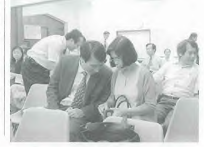
Hong Kong pastoral couple