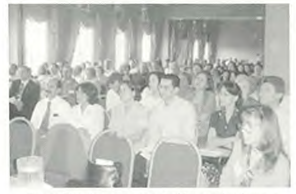
Puerto Rico clergy couples attend long weekend retreat in San Juan.