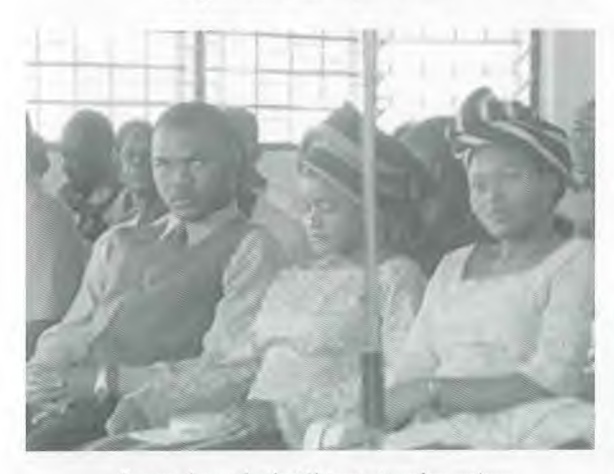
Pastoral couples in Ghana attend meetings