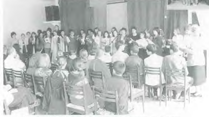
Shepherdess Advisory for union coordinators in Petergov.