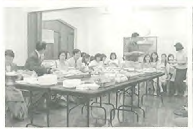
Hong Kong couples enjoy Friday night banquet.