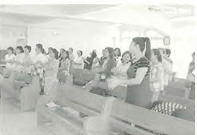
Taiwan pastors' wives exercising and singing.