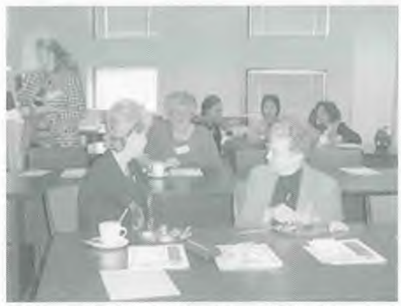
The ladies enjoyed breakfast and fellowship before the Annual Council Administrative spouses meetings each morning.