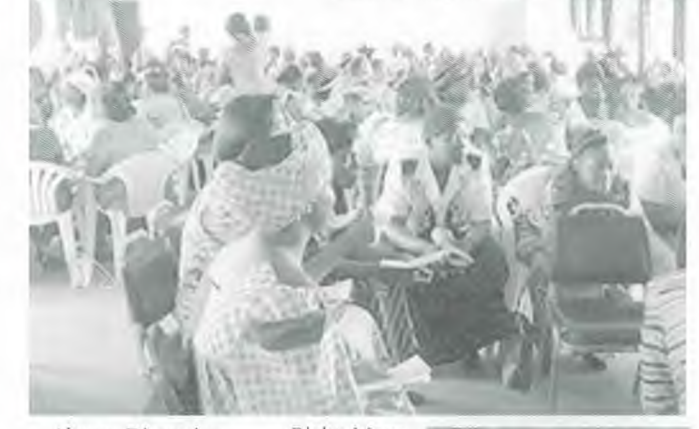
Above: Discussion groups during the Shepherdess meetings in Ghana