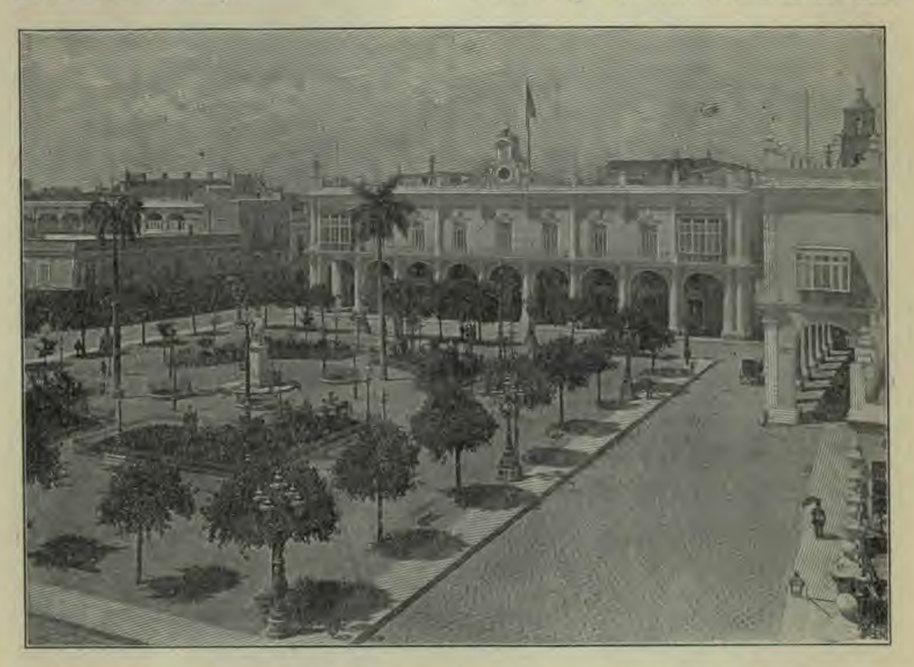
THE PLAZA AND PALACE IN HAVANA-SCENE OF THE GREAT EVENT OF MAY 20

Press Dispatches from Havana, May 20. As the flag [of Cuba] floated gaily to the breeze a mighty shout arose on all sides. Battle-scarred veterans embraced each other. Tears were in the eyes of all, and a whole people, as if overcome with emotion, became silent for a moment, and then, as though just realizing that they had taken their place among the nations of the earth, and remembering their best friend in the time