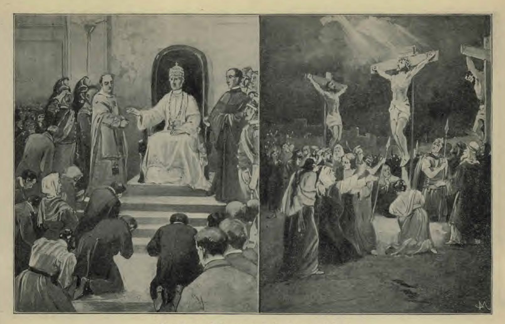
The Love of Power and the Power of Love (See page 825.)