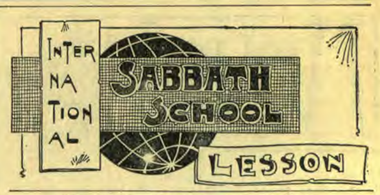
"Study to show thyself approved unto God."