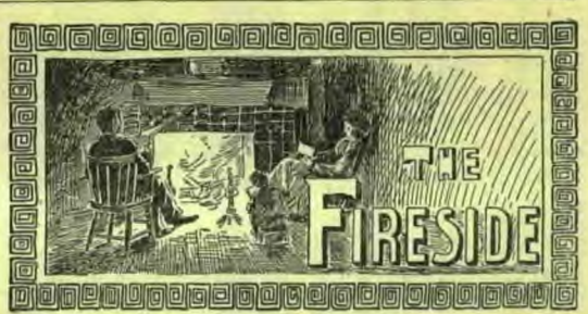
"That our sons may be as plants grown up in their youth that our daughters may be as corner-stones, polished after the similitude of a palace."

The political contest is for the present confined to the limits of the successful party. The controversy now is, Who shall receive the official rewards?