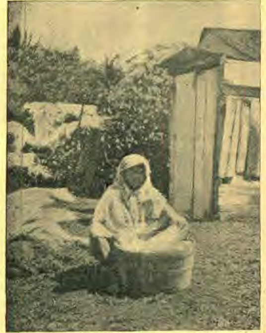
A Porto Rico Washer-woman.

has contributed to impart to the people a quality superior to any other of the West India Islands. In the first place, they have always been a purely agricultural people. Then, at an early period, the crown lands of the island were divided among the natives, who thus became a community of small proprietors, to which was given a new consistency and stabil-