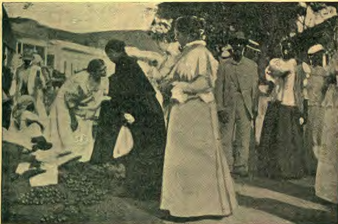
A MARKET SCENE IN PORTO RICO.

Besides the capital, there are some sixty or seventy towns and considerable villages in the island. Of these the most important are Ponce and Arecibo (each with a larger population than San Juan, that of Ponce being about 35,000 to 40,000, while that of San Juan is estimated at 25,000), Mayaguez (also larger than the capital), and Aquadilla, on the west coast; Fajardo and Humacao, on the east coast; Guanica and Aroyo, on the south; and Pepino and Cayey, in the interior. Aquadilla is especially important as a rendezvous for communication and trade with Havana. Its ex-