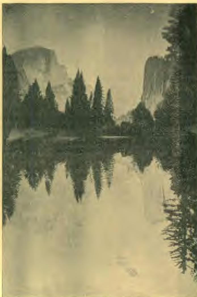
CALIFORNIA SCENERY, No. 1.—A view in Yosemite Valley. Washington Tower on the right and Half Dome on the left, reflected in Merced River. A fuller description of this wonderfully beautiful valley will be given later.

Air is also a non-conductor of heat. When air is oppressively warm, and no breeze is stirring, we are overcome by the heat, because the air does not carry off the heat generated in our bodies. Set the air in motion by use of a fan and we are soon relieved.