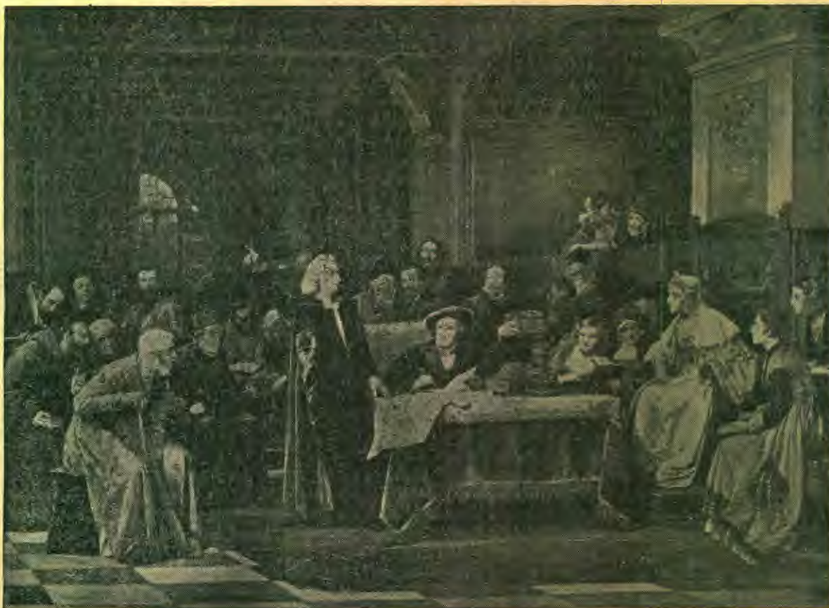
COLUMBUS BEFORE ISABELLA.

Being so thoroughly convinced, he at last decided to brave public opinion and present his views to those in power who might help him put them to the test. "After many wearisome delays, his suit was referred to a council at Salamanca, before which, however, his doctrines were confuted" from the saints