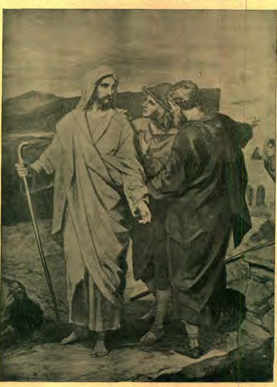
THE WALK TO EMMAUS.

words of One "who spake as never man spake." Their own hearts had been thrilled by an inspiration that they had not experienced from any other being. Their own eyes had often witnessed the healing balm that He had poured into many weary, sin-sick, and bur-