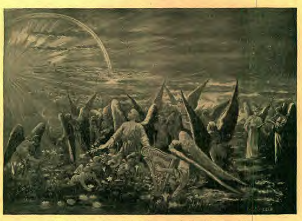
"In Heaven above There Sweeps the Eternal Chorus."

In heaven above there shines the eternal splendor, And every cloud that doubt of love hath brewed Is silver-lined, and rainbow-tinted tender By love's divine auroreal glory hued. In radiant light the Father, Son, and Spirit Shed forth such brightness through the ambient air That angels the vast blaze of love's full merit Do not unvailed its marvelous lightnings dare.