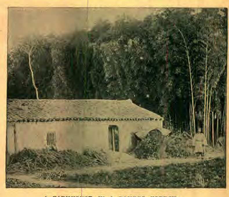
A FARMHOUSE IN A BAMBOO FOREST.

But the greatest need of all is for many more consecrated men and women to come to her