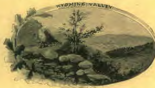
A Scene on the Lehigh Valley Railway.

These are always lovely, not grand enough to be terrible, even in their sternest winter aspect. They are my great comfort. Their stillness rests me when I am weary; and when faint, they remind me of the strength that is mine for the asking; for "the strength of the hills" is His who has promised: "As thy days, so shall