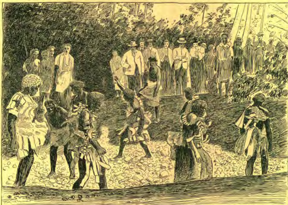
Fire-walking in the South Seas.

The natives here fear the priest and often speak of him as " e tangata purepure ," or sorcerer. He figures in this island as a native