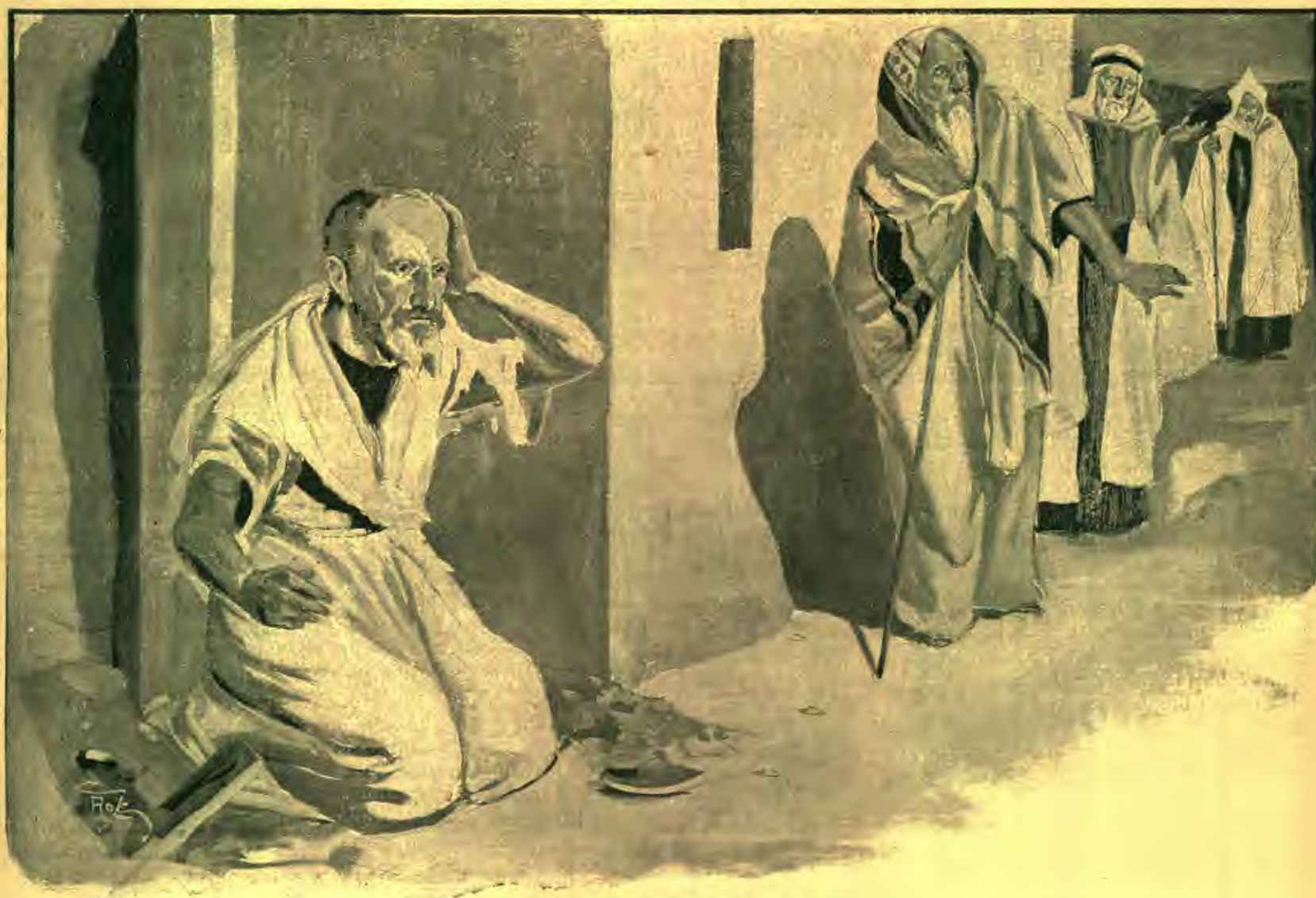
JOB AND HIS THREE FRIENDS.

Christ took His position with the poor, that He might lift from poverty the stigma that the world has attached to it. He knows the danger of the love of riches. He knows that this love proves the ruin of many souls. It places those who are rich where they indulge