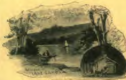
On the Lehigh Valley Railway.

Sweet human associations also cluster around these Lehigh hills. Among the trees which look so dark from my window, I roamed a blithe-hearted midget, serenely happy in the companionship of my scholarly father, who