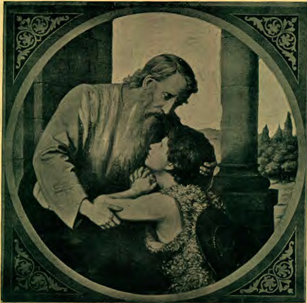
"HIS FATHER . . . HAD COMPASSION."

HE recognized that he had no claims on his father, and that he was unworthy to be called his son, yet he decided to return, saying, "I will arise and go to my father." I will tell him the truth. I will confess my sins. I will acknowledge my unworthiness. I will only ask to be as one of his hired servants. He carried out his resolution. He started for home. "But