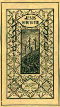
Size 3 1/2 x 5 1/2 inches

THE RETURN OF THE JEWS is an extremely interesting treatise on the much-talked-of question as to whether or not the Jews will return to Palestine. It is written from the standpoint of prophecy.