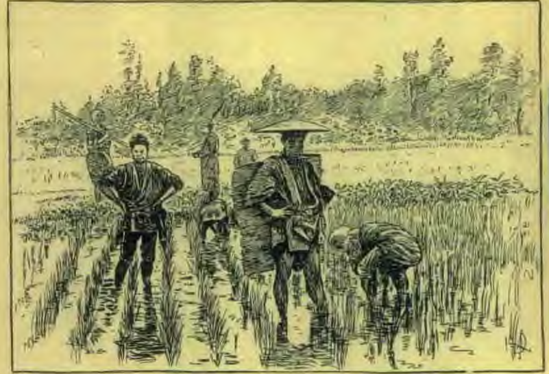
Rice Culture in the Philippines.

The Vasayan group of islands produces about 19,650,000 pounds of sugar annually. In Manila hemp the Philippines possess a unique product, but this is a misnomer, as it is no relation to the hemp plant. Its native name is abaca , and it is a product of a species of plantain or banana which differs very slightly from the edible variety. It is a hardy plant, growing from twelve to fifteen feet in height, and suffers very little from any enemy except drought. It grows best in the hilly volcanic formation in the eastern part of the islands. It