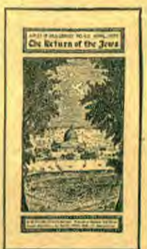
Size 3 1/2 x 5 1/2 inches

NATURAL FOOD OF MAN is a Scriptural setting forth of man's primitive and best diet, by M. C. Wilcox, and a collection of excellent recipes of thoroughly hygienic dishes, by Mrs. Flora Leadsworth.