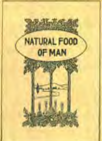
Size 5 1/2 x 8 inches

A FRIEND IN THE KITCHEN—The aim of this book is to educate people away from flesh eating by setting before them such a variety of wholesome and palatable dishes as will fully take its place.