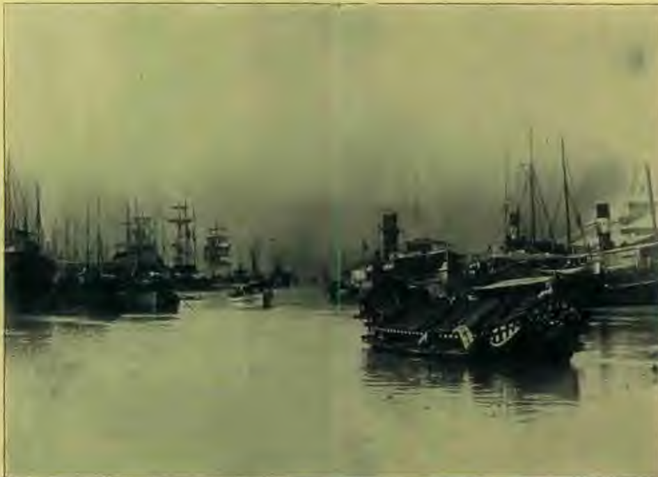
Shipping on the Pasig River.

The products of the islands are brought into Manila, the chief center of commerce, by the Pasig River, a line of small steamers running to all the different islands of the group, and the railroad running from Manila to Dagupan. This road runs around the western coast of the island through the fertile valleys and a succession of rice and sugar fields intercepting Caloocan, Malolos, Pampanga, Tarloc, and