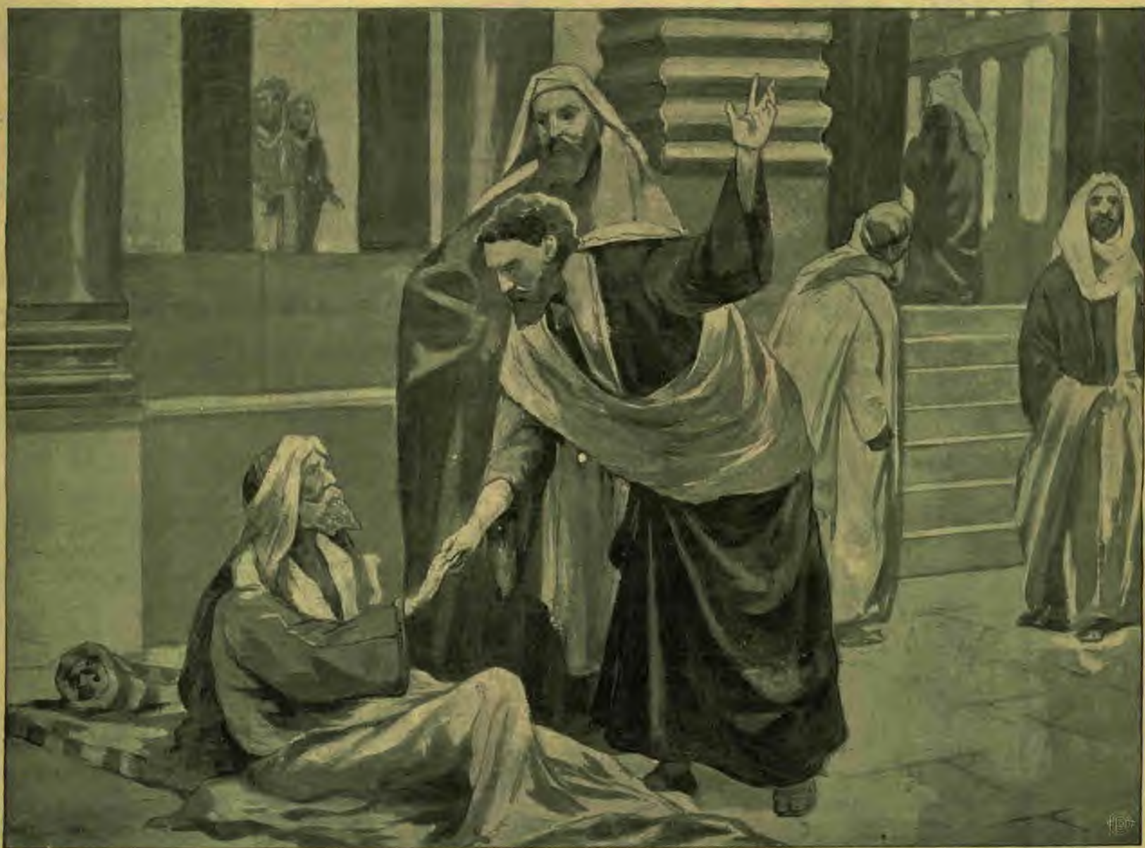
Healing the Impotent Man at the Beautiful Gate.

Up to this point all had been preliminary. The Spirit of God was reaching out through