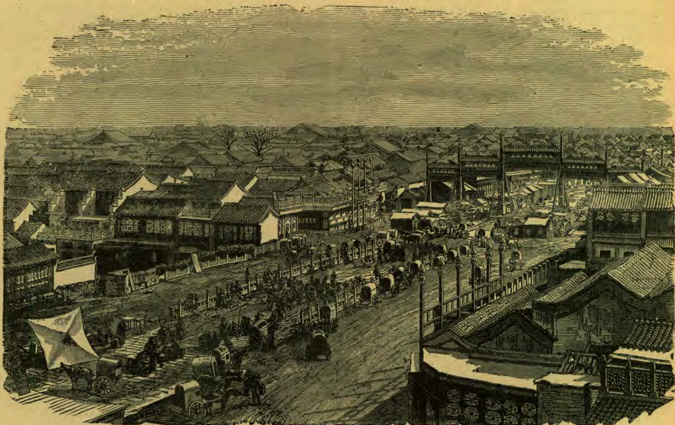
Scene in Peking, China.

"As if all these difficulties were not sufficient, Buddhism had hardly settled down harmoni-