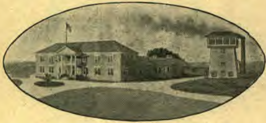
The Home of "The Signs of the Times."