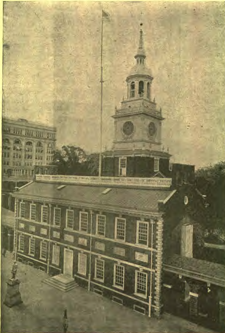
Independence Hall, Philadelphia.

all are protected in their rights. And as long as each individual is protected in his rights, so long can no class suffer from the infringement of their rights. The thing to be exalted, therefore, in a just and permanent government, by true citizens, by Christians, is the inalienable rights—common to all men—of the individual man, whether he be pagan or Jew, infidel or believer, Catholic or Protestant; for in this only are the rights of all conserved. This is equity, justice, and Christinity.