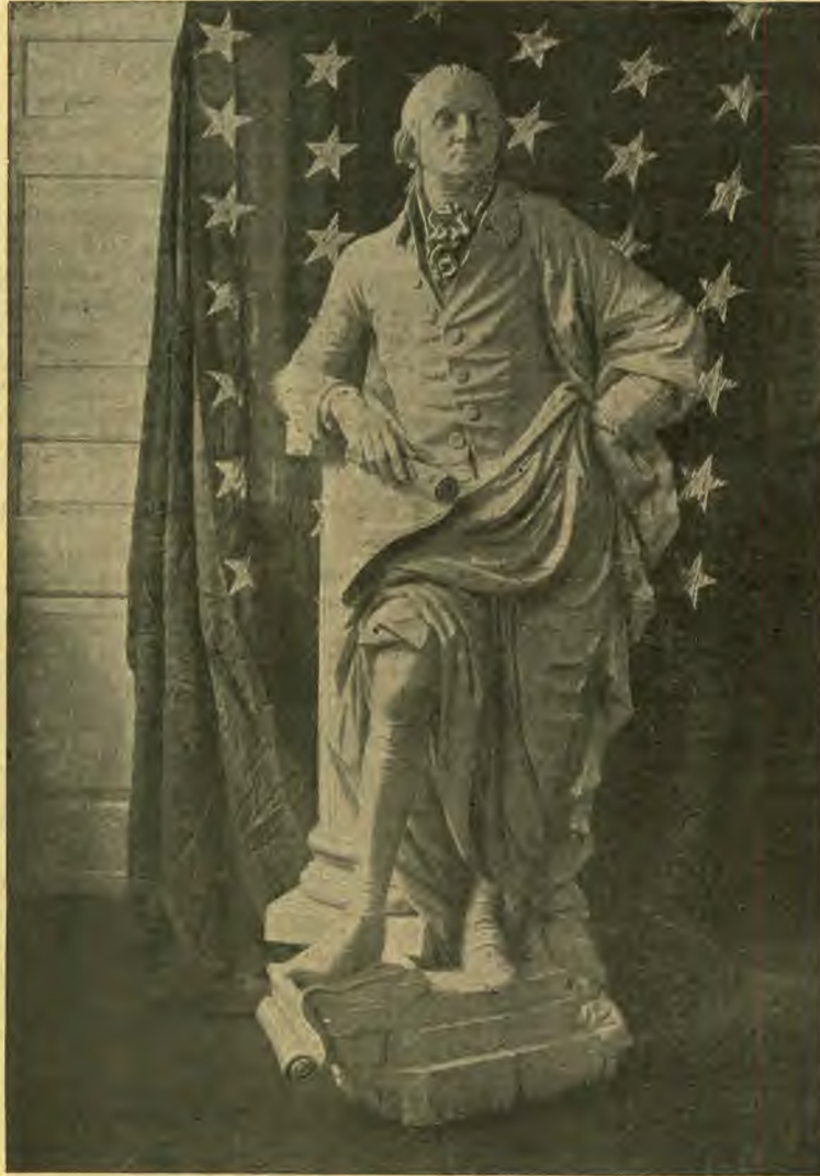
From a photograph of the statue of Washington in Independence Hall, Philadelphia. It was carved from yellow pine by William Rush, and is said to be the best statue of Washington made.

Already the doctrine that men are released from obedience to God's requirements has weakened the force of moral obligation, and