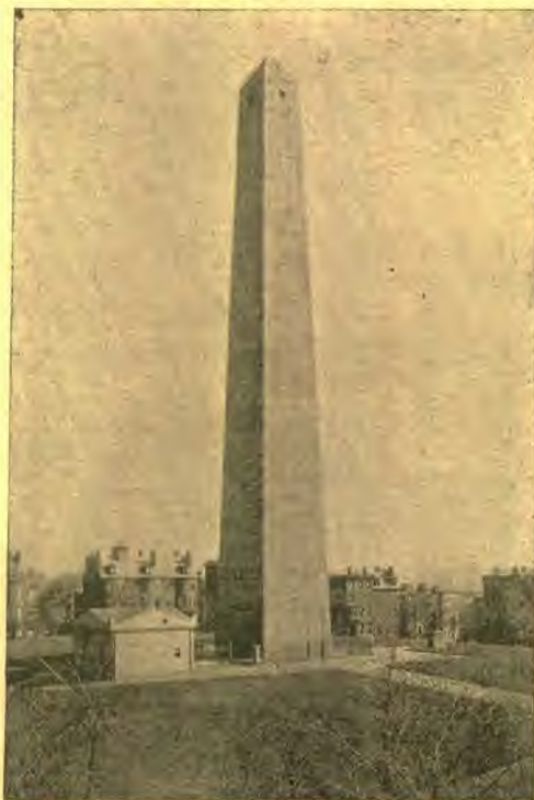
Bunker Hill Monument.

In this enlightened age, and in a land where all of every denomination are united in the most strenuous efforts to be free, we hope and expect that our representatives will cheerfully concur in removing every species of religious as well as civil bondage. Certain it is that every argument for civil liberty