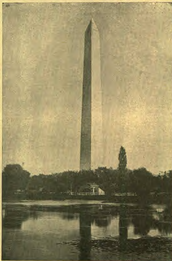
Washington Monument, Washington, D. C. Corner-stone laid July 4, 1848; cap-stone set Dec. 6, 1884; dedicated Washington's birthday, Feb. 22, 1885; height, 555 feet; weight, 81,120 tons; cost, $1,187,710. It is a wonderful monument, materially considered. But the principles of liberty held by the man it commemorates are eternal.

Mr. Bache, who is an authority on feminine apparel, says that a woman of fashion never