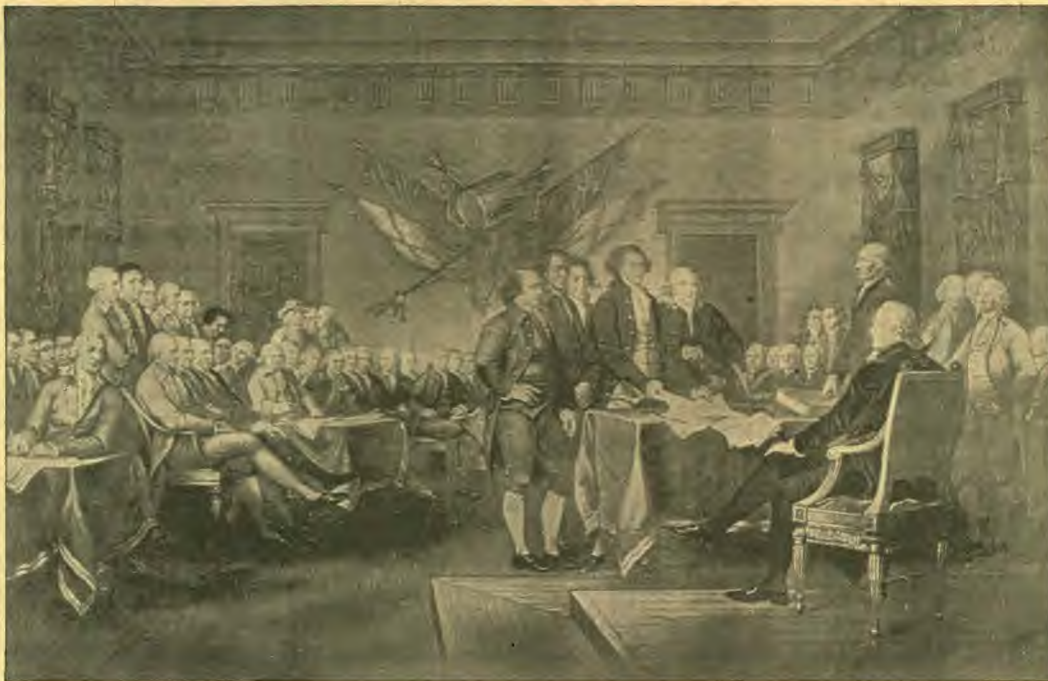
Signers of the Declaration of Independence.

AMONG the learned men who came to America in the eighteenth century was George Berkeley, afterward bishop of Cloyne, Ireland. He went to Newport, Rhode Island, to found a University, afterward giving his American estate and several hundred volumes of his library, to Yale College. It was while interested in America that he wrote