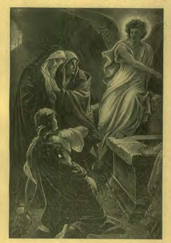
"The resurrection morn saw personified Righteousness arise triumphant."

And this is God's remnant church, the beautiful Ekklesia in her latest triumph. Persecuted tho she and her children are, all "the nations shall see and be confounded at all their might. . . They shall be afraid of the Lord our God, and shall fear because of Thee." Micah 7:16-19. The sons of Ziontaught of God, not men-shall have their piety, and power, and knowledge in Him, set against the sons of Grecia (worldly wisdom), and their culture, philosophy, wealth, education, and numbers. And God shall go with the sons of Zion, and make them "as the sword of a mighty man. And Jehovah shall be seen over them; and His arrow shall go forth as the lightning. . . . Jehovah of hosts will defend them. . . . And Jehovah their God shall save them in that day as the flock of His people; for they shall be as the stones of a crown, lifted up as an ensign upon His land. For how great is His