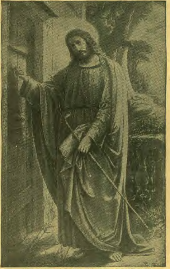
"Behold, I stand at the door, and knock."

In the absence of all Bible evidence, is it not the height of assumption to apply the term to the first day of the week? "But," says one, "has not the