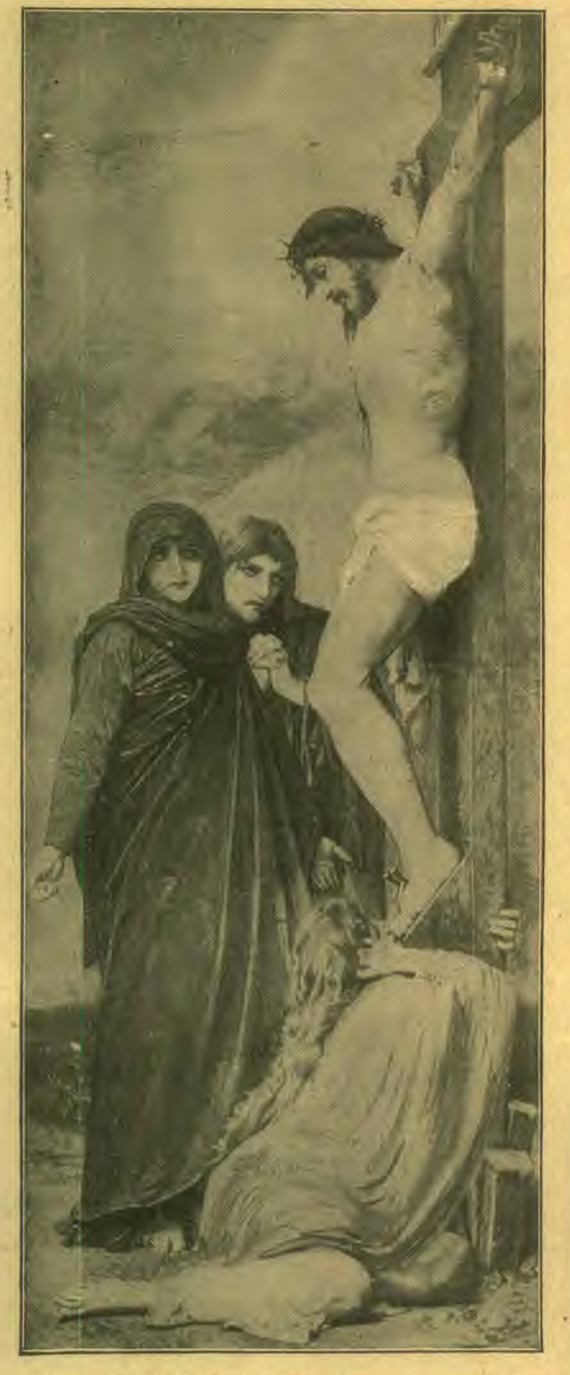
"He suffered, He died, to save those who caused His suffering."

The purchase of His blood will go out no more