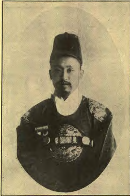
The King of Korea.

deeper and more vital need than this. The social and moral standards of the people should be raised. In other words, what Korea needs most is the uplifting, purifying influence of the Gospel of Christ. And the events of her recent history have opened the