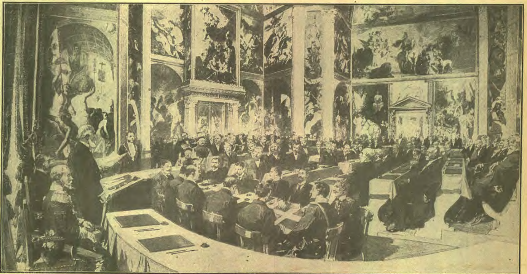
View of the First Peace Conference (1899), While at Their Deliberations in the "House in the Woods"