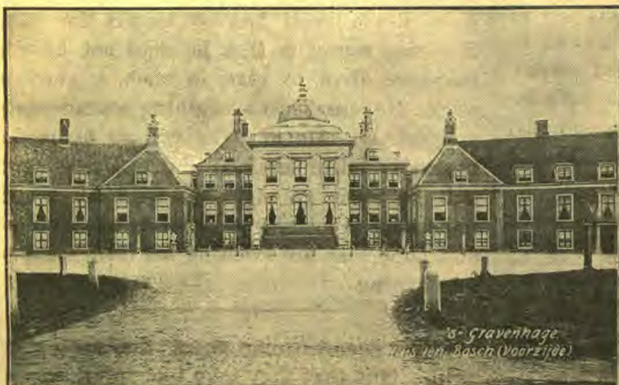
"The House in the Woods" Where First Hague Conference Was Held (1899).

It must also be remembered that while trade and commerce assuredly make for peace, they may also become occasions for severe wars. Business interests sometimes clamor for war. The eagerness of the Uitlanders to have a part in the government of the Transvaal in order to