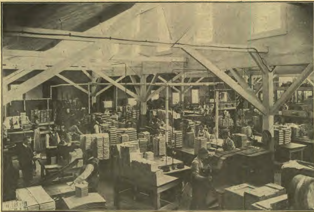
General View of Our Book-Bindery in Action.

THE cut on this page gives a general view of our bindery in action. These are very strenuous days with us here in the factory.