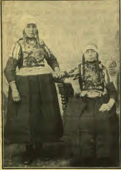
Dutch Peasant Girls, Isle of Marken.