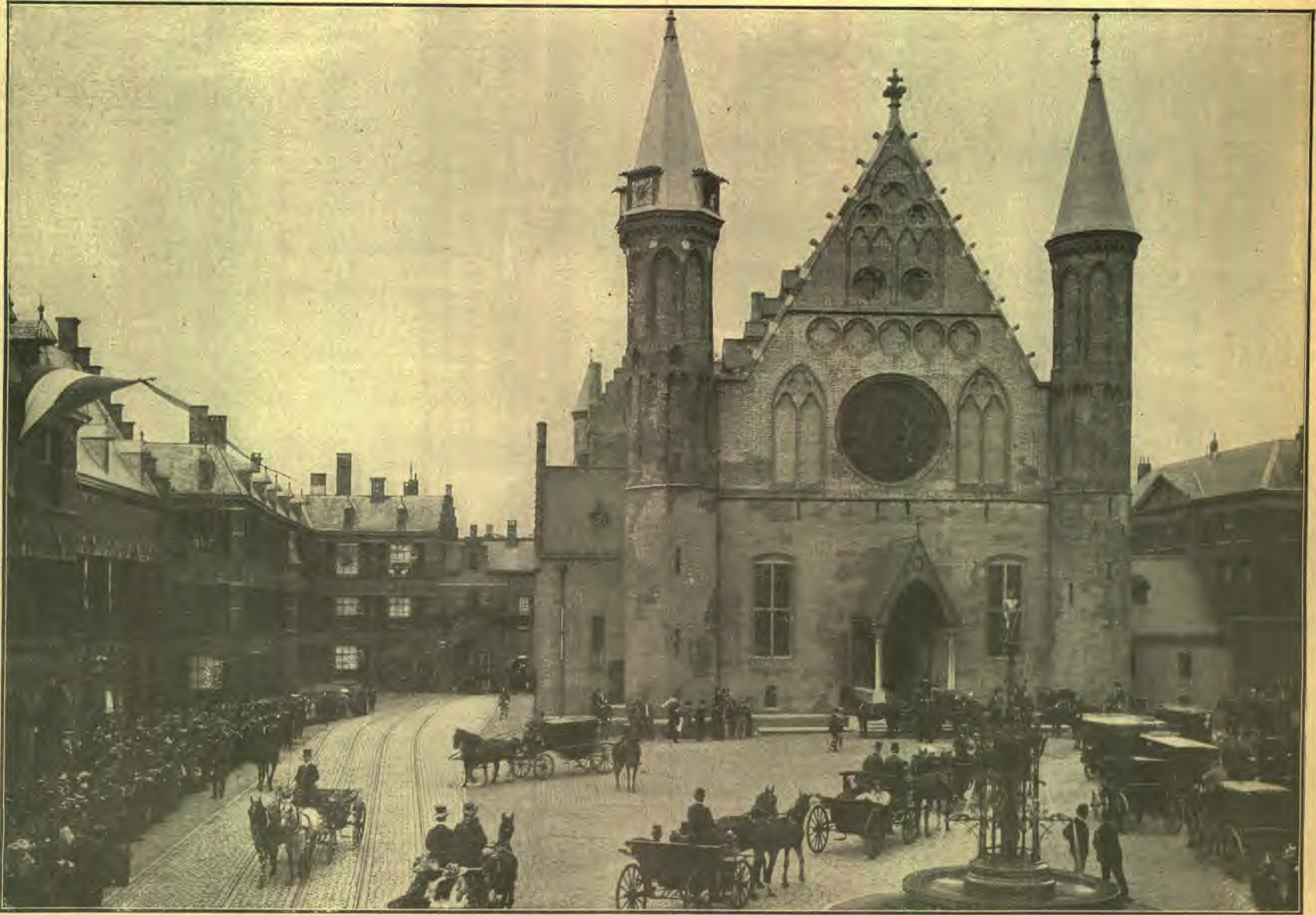
Peace Conference Building at The Hague—Opening Day (1907)