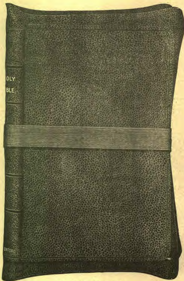
Actual Size 6 1/4 x 4 1/4 x 1/2.

It is not often that we select any one Bible and give it the prominence we are giving the one here shown, but our judgment on many years' experience in the Bible business is that it is worthy of it.