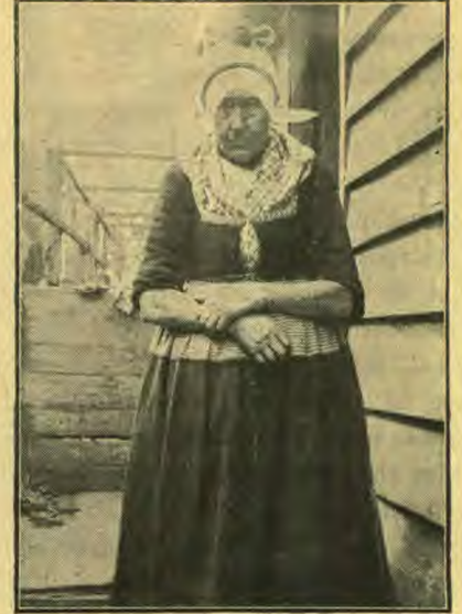
Dutch Fisher Woman, Volendam.

But there are also some disturbing elements. There is nothing certain about the political relations of the