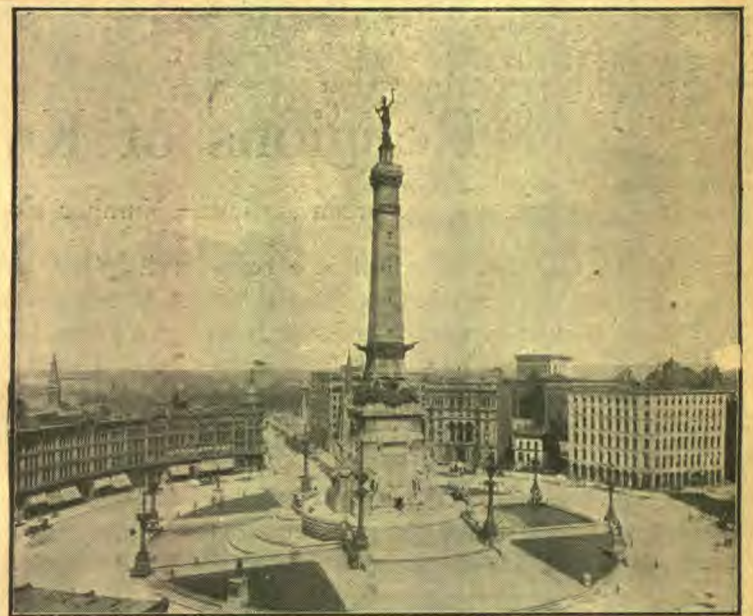
War Monument Circle, Near Headquarters, Where Picture of Delegates Was Taken

"We propose to cooperate with our separated brethren in advancing any cause that is for the good of the people. We have already done so in more than one instance. Our friends