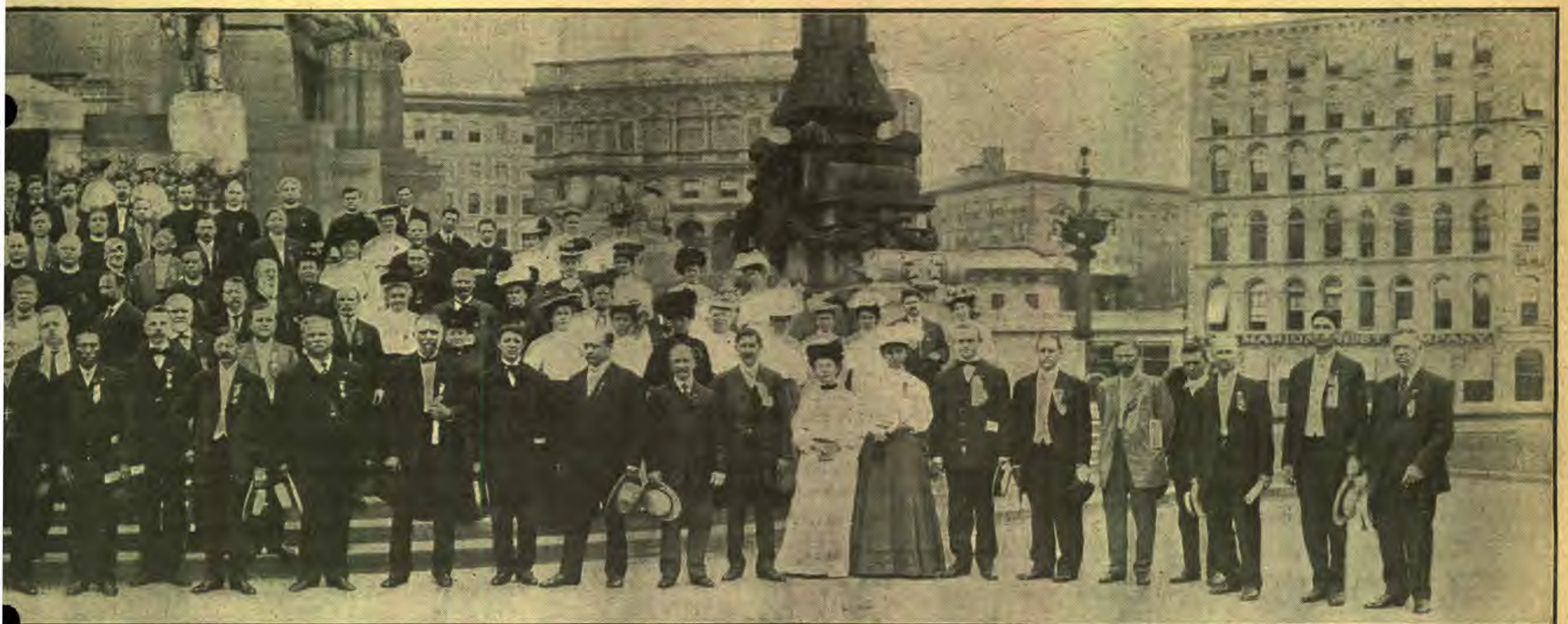
Federation of Catholic Societies, Indianapolis, Ind., July 14 to 17.

ing were the annual report of the president of the federation and the annual report of the national secretary.