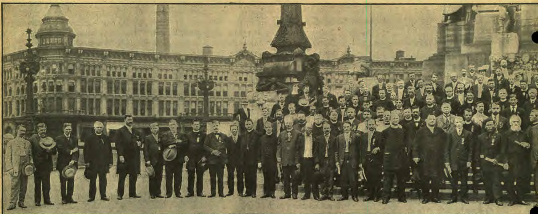
Official Delegates to the Sixth Annual Convention of the American Federation of Catholic Societies.