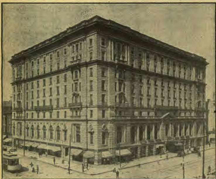
Claypool Hotel, Headquarters of the Convention.