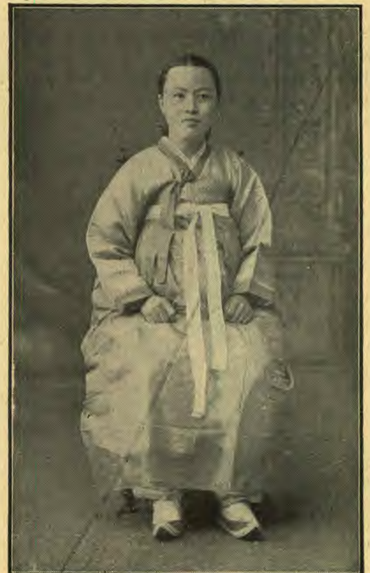
A Korean Lady.

Korea was opened to foreign residents and foreign intercourse in the year 1884; and in the same year the first Protestant missionaries entered the country. But the Roman Catholics had preceded them by exactly a century. The first efforts of the Protestant missionaries met with very scant success.