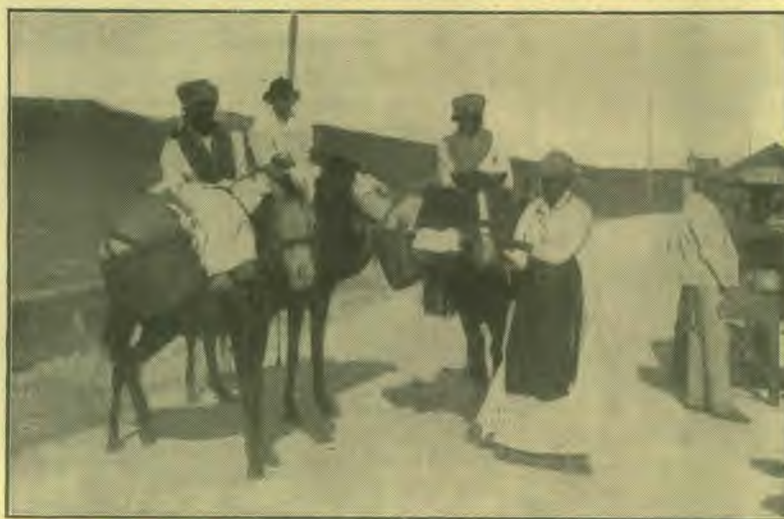
Porto Rico Women on the Way to Market.

In 1870 the slaves were freed, but they were afterward employed by the owners of the estates at so low a wage that the difference was very slight.