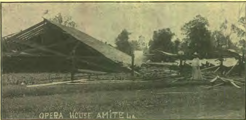
OPERA HOUSE, AMITE, LA.

wife, nor his man servant, nor his maid servant, nor his ox, nor his ass, nor anything that is thy neighbor's."