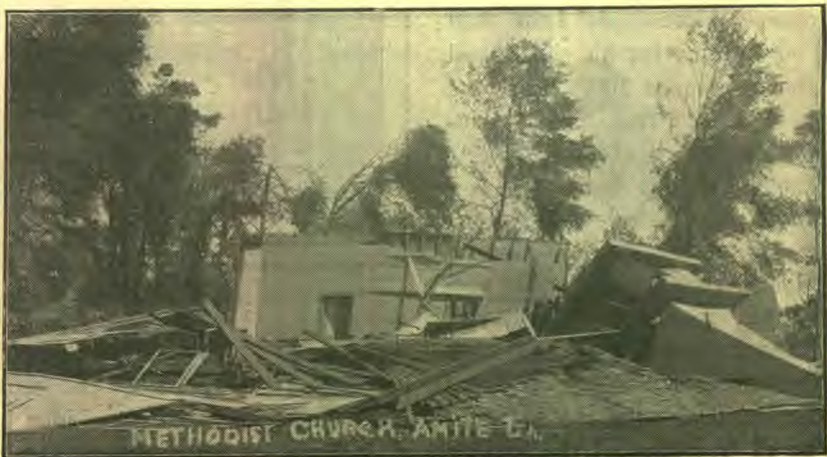
METHODIST CHURCH, AMITE, LA.