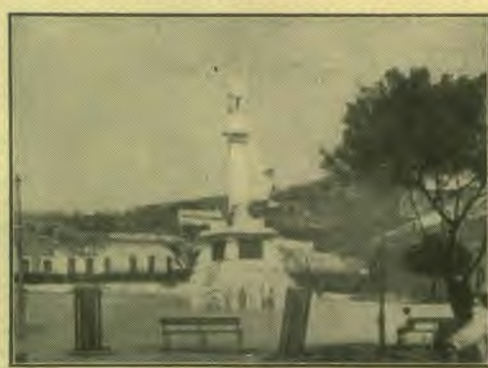
The Plaza and Statue of Columbus, San Juan, Porto Rico.

There were no roads, hence but little communication; each estate had its own slaves, and the owner was master of all. The products for exportation were carried to the ports on mules, thence in Spanish ships to Spain, and exchanged for Spanish goods. A trip to the capital required as much time