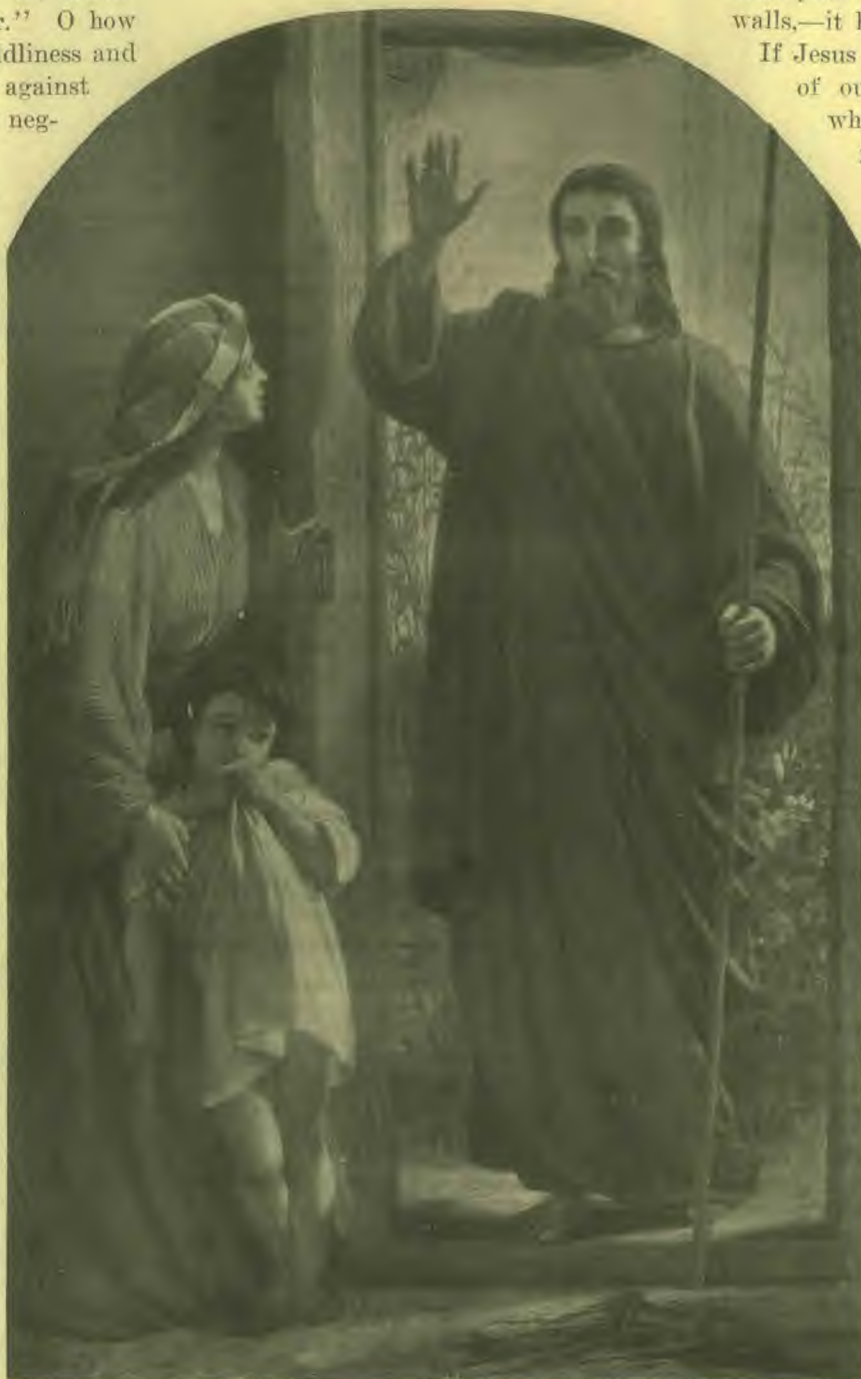
"Peace Be to This House."

coming language to your faithful horses, and rude and unchristian words to Jim, your hired man. Your little boy heard the same words, and saw you kick the poor, dumb brutes in the yard, because you were in a temper. What! do you expect him ever to