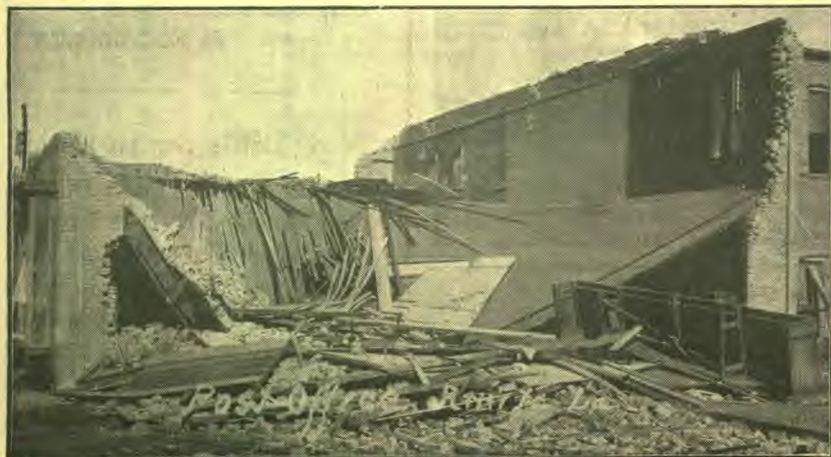
Post Office, Amite, La.

In the recently formed Holland Cabinet, the minister of justice, the minister of finance, and the minister of public works are Roman Catholics.