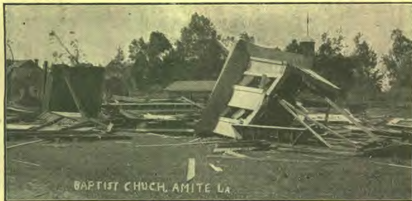
BAPTIST CHURCH, AMITE, LA.