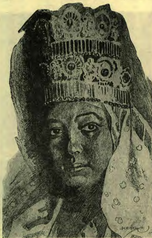
The ambitious, unscrupulous queen of Abyssinia, who reached the throne by a series of cruel murders, among which were two or three husbands

The happenings of the last months, in which the bishop and priests, after the death