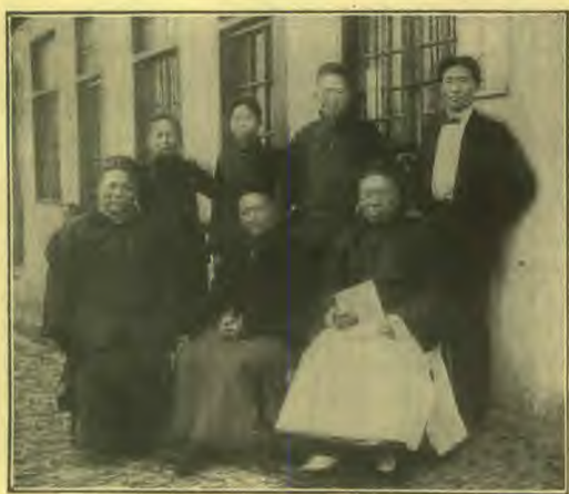
GROUP OF CHINESE NATIVE EVANGELISTS

I HAVE just returned from a ten days' itinerating trip, visiting companies and interested persons. At Hui-An, China, a four days' meeting was held. A native evangelist has been working at this place for some time, and a good interest is manifested. At the close of the meeting ten souls were buried with their Lord in baptism. We expect that by the first of the year nearly as many more will be prepared for this sacred ordinance.