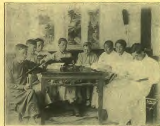
CONDUCTING A BIBLE STUDY IN OUR CHAPEL AT SHANGHAI

Baptisms: Montana 5, Oregon 27, Washington 27, Idaho 73, Ontario 20, New Brunswick 29, Alberta 6, California 38, Missouri 11, Minnesota 73.