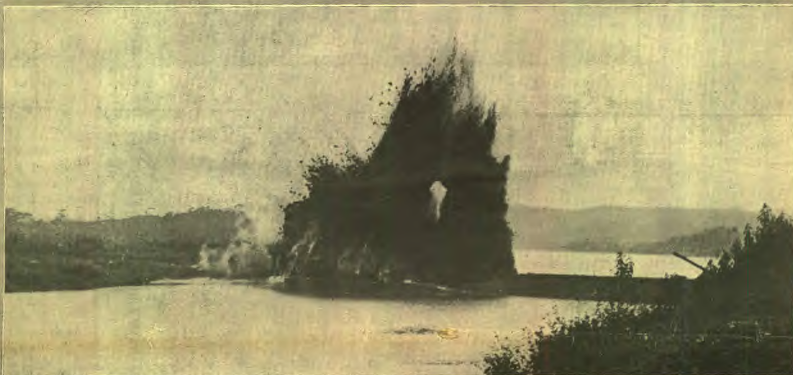
BLOWING UP OF GAMBOA DIKE

PACIFIC PRESS PUBLISHING ASSOCIATION MOUNTAIN VIEW, CALIFORNIA