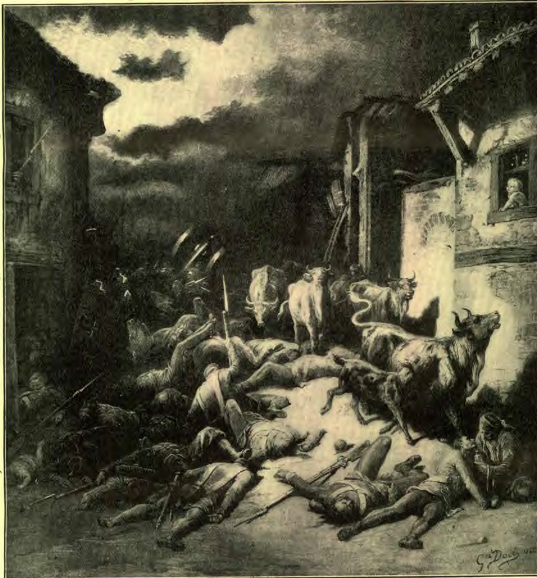
"THERE WAS NEVER A TIME IN THE HISTORY OF THE WORLD WHEN THE ANGER OF NATIONS WAS SO MANIFEST AS AT THE PRESENT DAY."

in Me." Verse 1. The Son of God had espoused the cause of His people, even to the extent of the restoration of their lost inheritance, and He speaks of mansions in connection with the preparation of their future home.