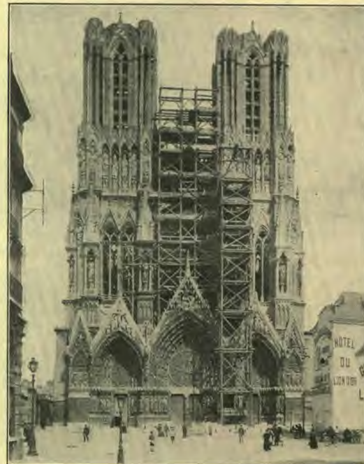
HISTORIC CATHEDRAL AT RHEIMS, FRANCE

THE big armies in Europe are not only killing each other by the thousands, but they are destroying harvests, and also food supplies stored in warehouses and granaries, as well as whole cities, villages, and numerous country homes. This is leaving multitudes of women and helpless children not only homeless but destitute of food and clothing. The suffering that will result will be beyond description; and while many of our business men have been looking forward to the great increase in commerce and manufacture that would come to