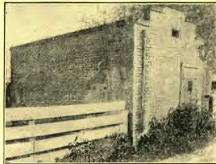
Grass-grown path in front of a jail one year after the town went "dry"

That every friend of the cause should both vote and work?