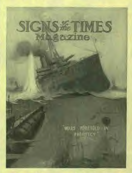
August Magazine Cover in Miniature

Read all he says about this, and about the blighting influence of mind cure, in the August number of the