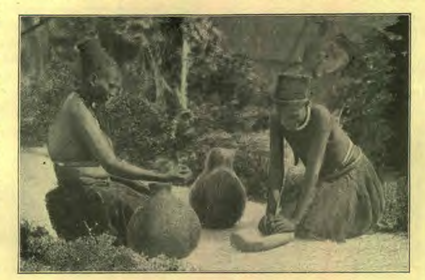
ZULU WOMEN GRINDING CORN

The fact is, in such performances, the church harks back to the days of dark superstition, when sight, instead of Biblical faith, was the basis of worship. Indeed, so strongly