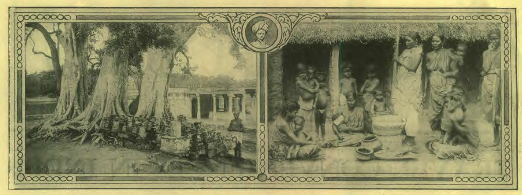
Three "spirit" trees and temple of devil worshipers of South India. Worship of this class is one of the most pitiful of superstitions.