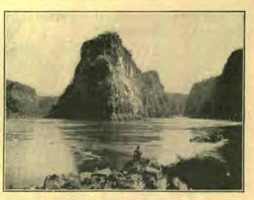
SCENE ON THE ZAMBEZI RIVER BELOW VICTORIA FALLS

So the visitors ceased to be mere auditors, and our hearts