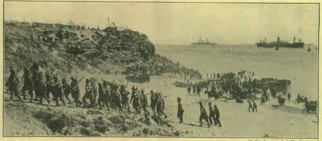
ALLIES LANDING AT THE DARDANELLES UNDER COVER OF GUNS OF THE BATTLESHIPS

receive. Heaven's golden gate opens not to the self-exalted. It is not lifted up to the proud in spirit. But the everlasting portals will open wide to the trembling touch of a little child. Blessed will be the recompense of grace to those who have wrought for God in the simplicity of faith and love.