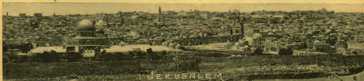
"His capital will be Jerusalem. Stand back, London! Get out of the way, Paris and New York!" Above, a view of modern Jerusalem, where many believe the capital of Christ's kingdom will be established soon.

As the first event to happen in the immediate future, these teachers place the second coming of Christ. This coming of the Saviour they believe to have two phases: first, a coming for His church; and second, a coming with His church. The first phase, in their belief, is to be a secret, invisible coming. The second phase is to be an open manifestation to all the world, accompanied by a demonstration of power and glory unparalleled in the history of the world. They believe that these two phases of the second coming of Christ will be seven years