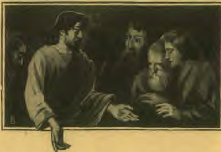
They beheld Jesus, and He was truly alive. The prints of the nails were there, and He ate with them. Then they believed.

Holy Spirit. He comes to you when I leave you. Varied and special blessings shall be yours when He comes to dwell with you. "He will show you things to come." "He shall glorify Me." "He shall receive of Mine, and shall show it unto you." And His presence will be My presence. I can thus come nearer to you by being in heaven than I could were I to remain with you. This gift of the Holy Spirit will endow you with power to accomplish more in My name than could be accomplished should I remain here. Hence it is expedient for you that I go away.