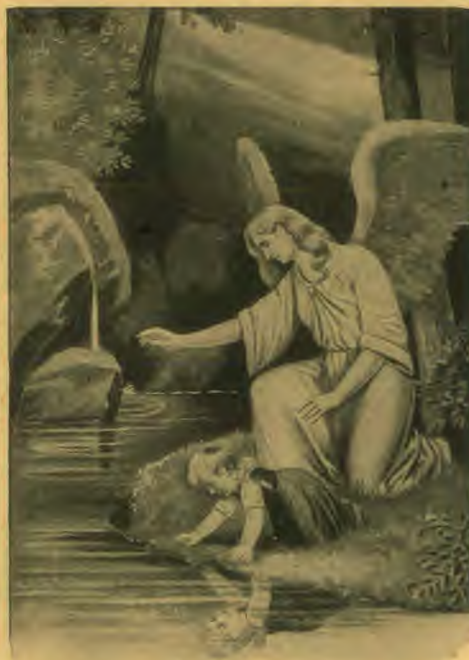
The child is protected by guardian angels; unseen influences guard life and limb, from the cradle to the grave.

"Law" is but our word for the stated, regular, orderly way of nature's action. God is the ruler, and law is His regular