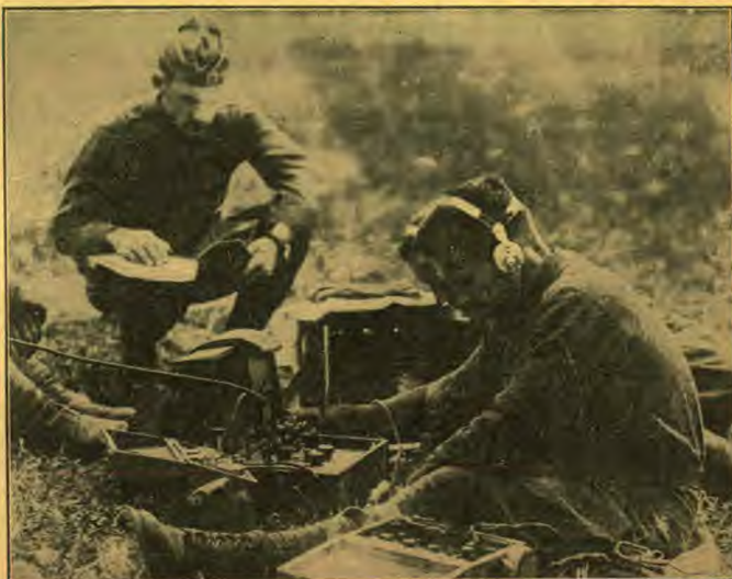
The aeroplane never loses touch with the earth, even though long distances away. Radio signaling is regularly carried on. These Americans are signaling to aeroplanes, using the regular field equipment provided for that purpose.

What the world needs to-day is a message that will make the individual feel his accountability to God, that will help him