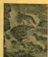
“The four symbolic beasts of Daniel 7.”

change, and you can begin to count on another day; and I believe the same power that established the Sabbath in the first place, fixed it on the first day of the week when the Lord Jesus Christ rose from the dead.”