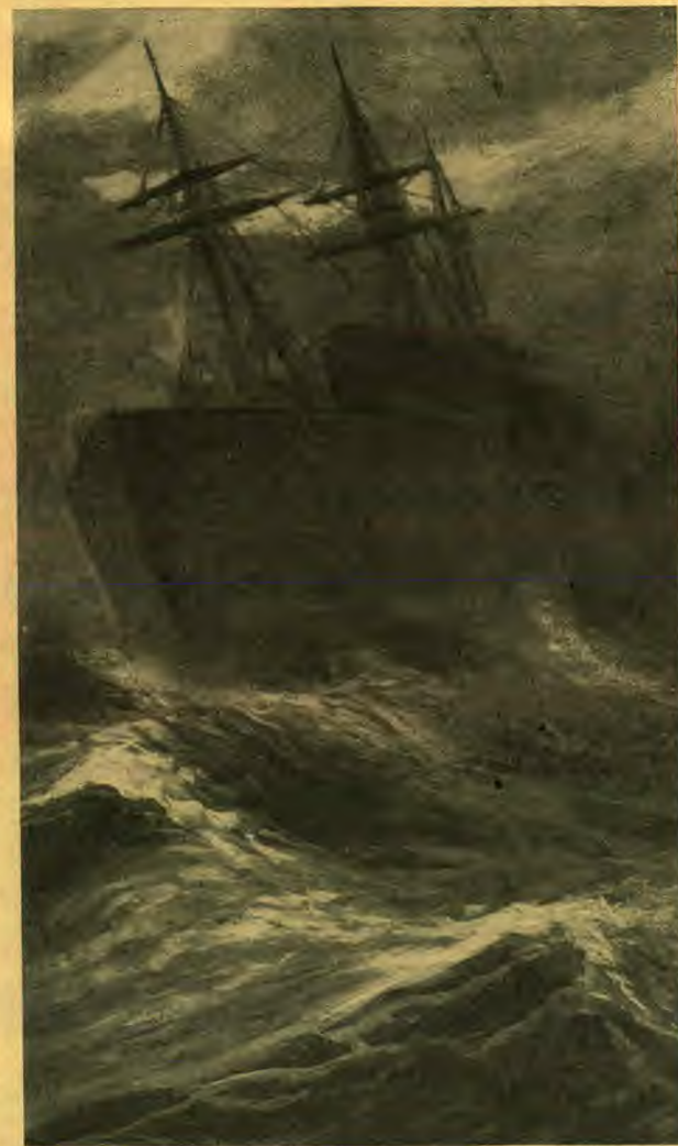
"Instead of going to sea, he was compelled to go into the hands of a physician. . . . The ship never returned."

How did it chance that his arm was around the tree and his foot on the stone? However he might question how stone and tree came to be in that particular spot, they had been used providentially to save his life. We see in it no violation of natural law. We know that some impulse—whether purely his own, or suggested from above, we cannot say