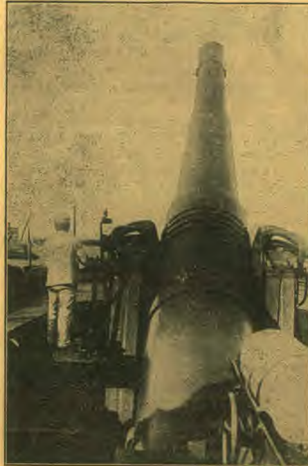
One of the giant superguns used by the British who were operating with the Italians on the Piave. Such guns mounted on monitors were powerful arguments that were largely responsible for the Austrian change of heart and ultimate defeat. Will the hoped for League of Nations provide for the complete disarming of the nations?

Prohibition is not destroying any of the vineyards of the nation. It is simply putting an end to the wicked use that is being made of those vineyards. It is merely saying to the vineyardist who has been using his grapes in the manufacture of intoxicating wine, "You shall not be allowed to continue the destruction of our homes through your vineyards." Prohibition is only saying to these vineyardists, "When it comes to a question between your vineyard and our sons and