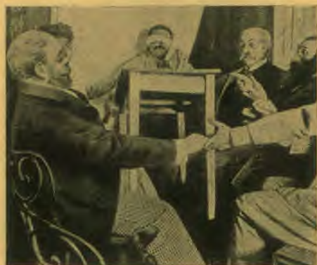
A table is lifted and musical instruments are played in broad daylight, and moved swiftly to different parts of the room, with no human hand touching them. These and other manifestations occurred in the case of the noted medium Eusapia Palladino.

missionary. No wonder that many, viewing the situation at first hand, have felt the question with irrepressible force rising to their lips, "Who is sufficient for these things?"