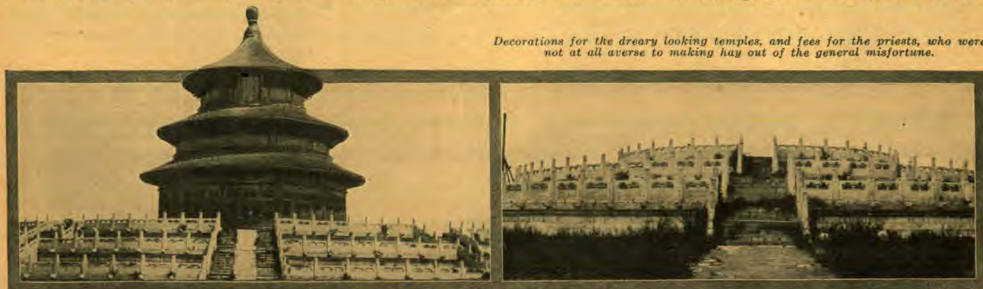
Decorations for the dreary looking temples, and fees for the priests, who were not at all averse to making hay out of the general misfortune.

Many of those gathered about the table seemed unimpressed, but there were others who flattened the palms of their hands together in the accustomed atti-