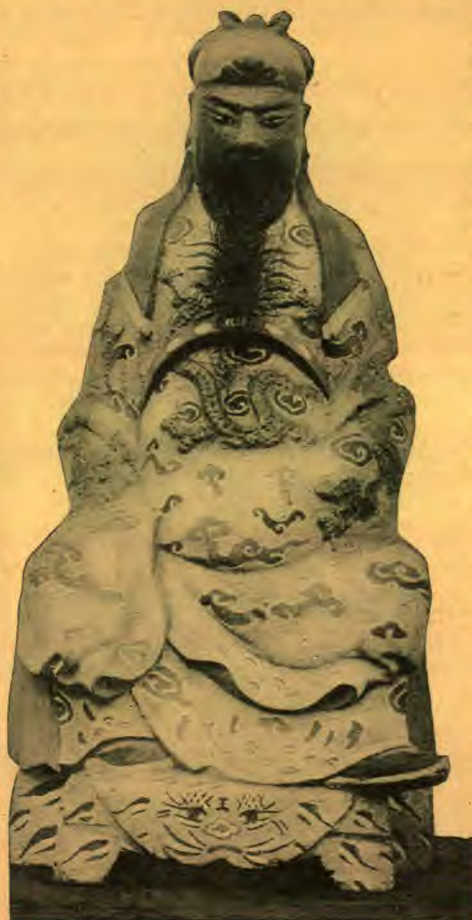
He was a lumbering idol, very pink and benignant of countenance, with a long-black beard and enormous ears.

In the midst of the frenzy—for at its height, it seemed little less—a huge wooden idol, "a good god," we were told, was taken out nightly from village to village, and later in daytime processions. He was a lumbering idol, very pink and benignant of countenance, with a long black beard and enormous ears. His richly embroidered robes were covered on occasion with a scarlet and again with a yellow cloak. His headdress was a gorgeous structure, all gilt and tinsel and fluttering silken balls of many colors, or again wrought of fine embroideries, or still again just a plain "monk's hood" of the color of the cloak. On two occasions, I sat very near this idol—just behind