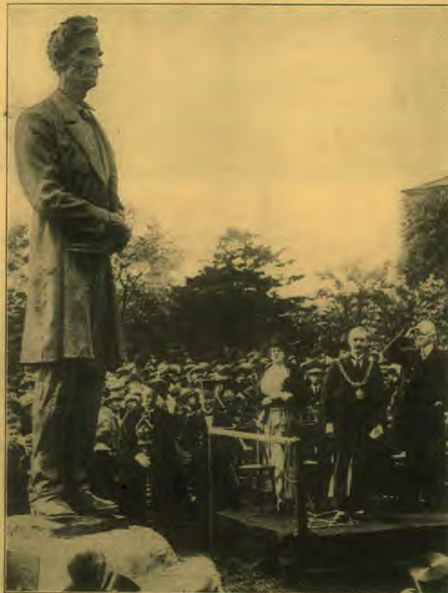
Englishmen have generally been admirers of Abraham Lincoln, in spite of his Americanisms, and have recognized in him the spirit that breathed of the Magna Charta and the long struggle of the English race against tyranny and autocracy. The Barnard Statue of the great emancipator was unveiled with impressive ceremonies at Manchester, England, by Judge Alton B. Parker, United States ambassador to England. Judge Parker stands at the right, on the speaker's stand, with his hand at his forehead. At his right is the lord mayor of Manchester, John W. Davis, just in front of his wife, whose head appears over the mayor's shoulder.

who live upon this earth, that our heavenly Father will not allow Satan to have his own way! He has already been cast out of heaven; and soon he is to be dethroned and destroyed from this earth, so that God's universe may be completely cleansed from all sin and every wrong way, with all the attendant sorrows and griefs. The inspired record is explicit concerning his final overthrow: "I will bring forth a fire from the midst of thee, it shall devour thee, and I will bring thee to ashes upon the earth in the sight of all them that behold thee. . . . And never shalt thou be any more." Ezekiel 28: 18, 19.