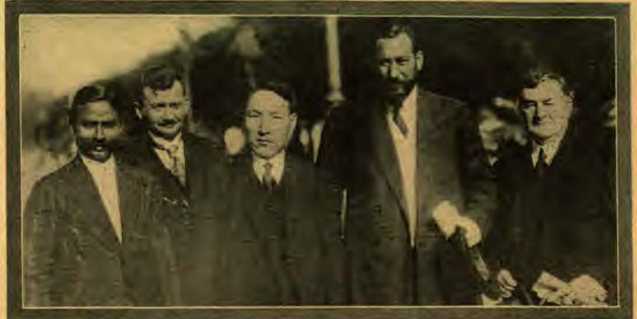
Switzerland, the rendezvous of nations, not long ago entertained delegates to an International Socialistic Conference at Lucerne. The photograph shows an East Indian, a German, a Korean, an Egyptian, and an Irishman meeting in unity, at least long enough for a picture.

But the earth will remain, and will endure forever; so it would be far better to substitute some other phrase for "the end of the world," such as "the end of the age," because the former has been misconstrued and effectively used against the adventual doctrine, by those of the postmillennial belief.